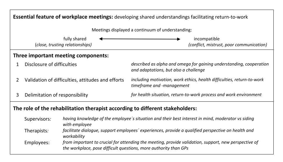
Figure 1. Summary of main findings.

in parenthesis): 1) high school (teacher); 2 hardware store (cashier); 3 laboratory (technician); 4 rental firm (salesperson); 5 factory (factory worker); 6 primary school (teacher); and 7 factory (factory worker). In the workplace meetings, a variety of subjects relevant to facilitate return-to-work were addressed, including the presumed timeframe for return-to-work, the appropriate increase of work hours, and the adjustments needed to resume work. However, the foundation for finding these practical solutions, and what surfaced as the prominent feature of the meetings, was the time spent on developing a shared and appropriate understanding of the employees' health- and work situation that could facilitate return-to-work. We identified disclosure of difficulties, validation of difficulties, attitudes and efforts, and delimitation of responsibility as important meeting components that the therapists played a vital role in addressing.