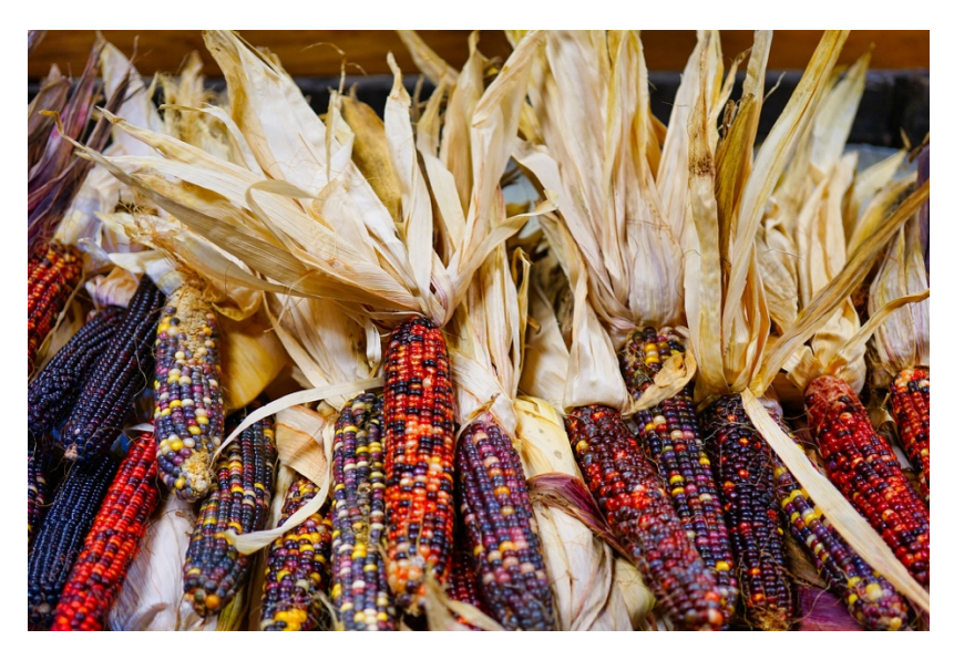
Figure 1 multi-colored corn in Peru<sup>1</sup>

Most people will imagine the corn cobs yellow and more or less uniform, which illustrates the institutionalization of the globally hegemonic ethnocentrism of the Western epistemology and the implications of Cartesian subjectivities. The yellow corn cob stands for the Cartesian subject that projects his local worldview as global, without disclosing the local roots of his epistemological and ontological choices. Those practices need to be seen in a context of imperial relations, where the yellow corn cob has the power to define and control the production of meaning and has control over the establishment of institutions and laws, as well as the distribution of wealth and labor.