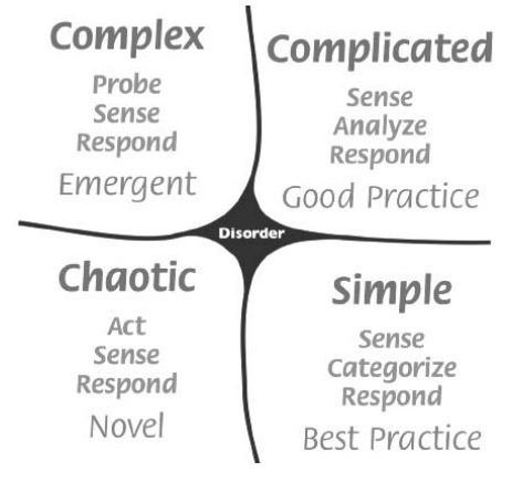
Fig. 1. The Cynefin Framework

The Cynefin framework (Figure 1) is a decision-making tool from the field of knowledge management and complexity science [16]. It is intended to help its users make sense of the current situation in order to act accordingly. To this end, it splits decision-making circumstances into five domains, discussed below. In the context of ISUs, it can help us better understand why practices and methods applied in ISUs either support or do not support their service and business development. We utilized the Cynefin framework, as it was adopted successfully in research about software startup before [31] (section IV).