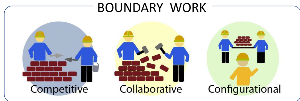
Fig. 1 The three categories of boundary work