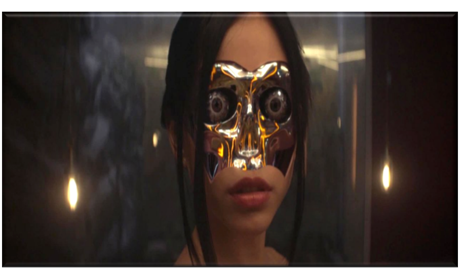
Figure 1: Screenshot from Ex Machina (Garland, 2014, 01:10:42)

Master's thesis in FILM3090 Supervisor: Ilona Hongisto June 2021