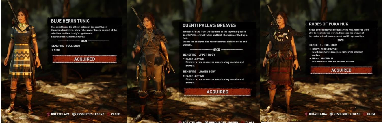
Figure 6: Croft in outifts from Paititi.

Building even further upon this way of portraying Croft as the saviour, she is tasked with locating three ceremonial items for the future king, Unuratu's son Etzli. Originally a task for the father, in this case Etzli's surrogate father Uchu, it is given to Croft because Uchu has more important things to take care of due to the situation with Amaru and the Order of Trinity that Amaru belongs to.