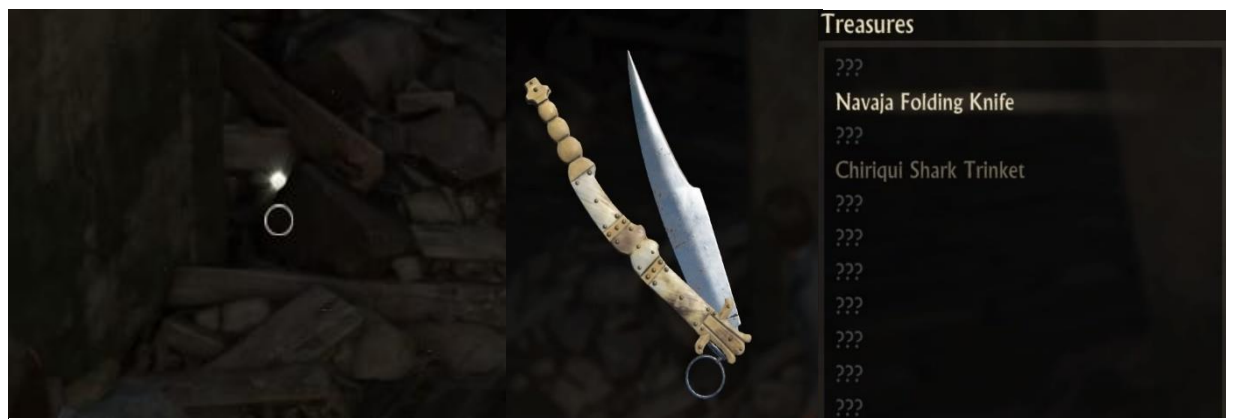
Figure 4: The glimmer and the treasure located in an old tower.

In choosing this way of placing the artefacts, they are left in their original context, unlike with the Tomb Raider series, but it also means they're harder to find and are less tied to the story. The documents are easier; pages placed on a table or in the leather bag next to a skeleton.