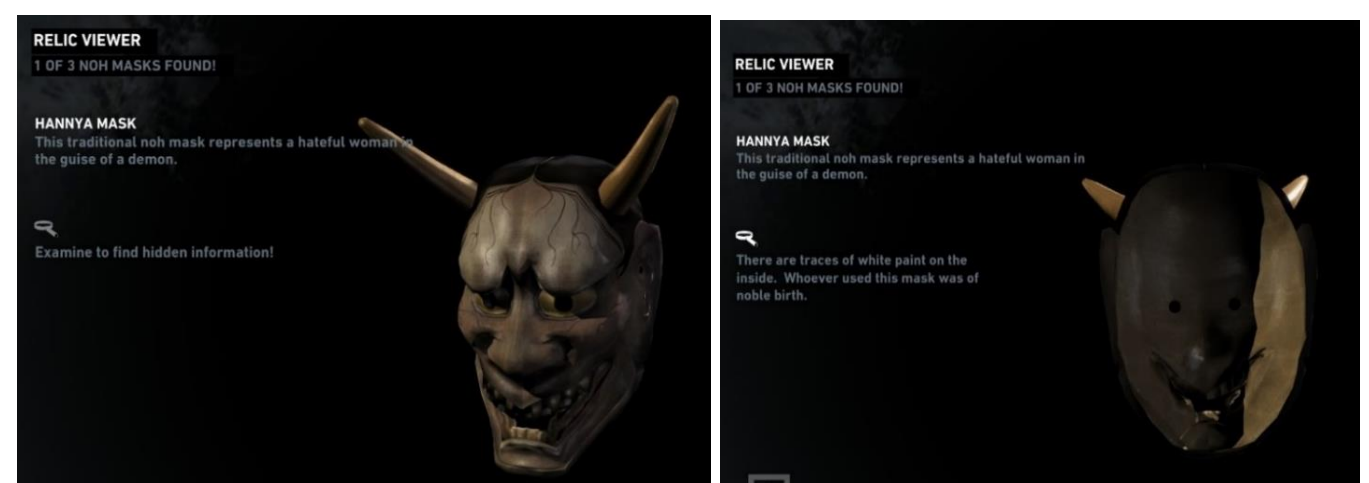
Figure 3: Some relics offer more information upon further inspection.

As someone who studies or has an education in and experience with archaeology, it makes you question how regular players of the game view these choices, and how those views can differ from ours.