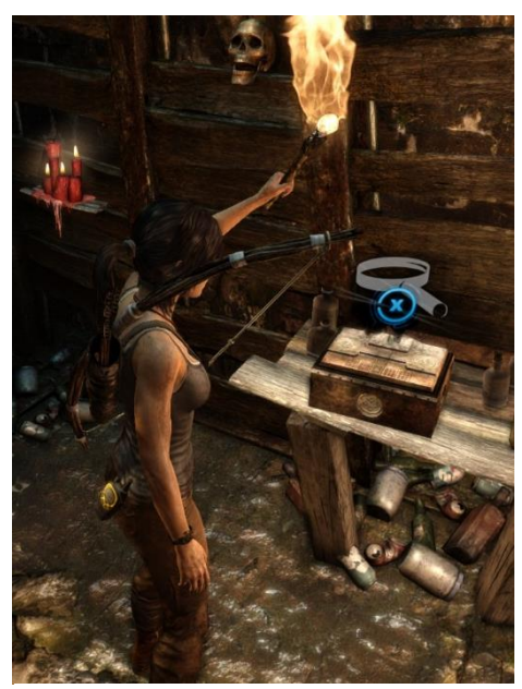
Figure 2: A box containing the first relic Croft comes across, a Hannya mask.

Non-archaeologists might not think of such questions, might not wonder why these choices were made. Was this a deliberate choice to make the items easier to find, to save the player from having to manually locate and dig up the items? Maybe it was to make the players interested in continuing to locate these artefacts, because they're easy to find this way. After all, one might claim that not everyone would be interested in doing it 'the actual way' and the developers would prefer to have every