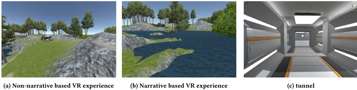
Figure 1: Immersive environments showing non-narrative vs narrative VR setups

and simulations. Experiences derived from the VR will be used for preventive and emergency measures to save lives and cost thus shaping society in a better way. In the following paper our goal is to measure the influence of IDN on a VR environment through subjective user evaluation. The main objective of this research is to explore how IDN affect the user experience in an immersive VR environment in terms of user engagement. This is done through an experimental study where subjective evaluations are performed in VR with two groups i.e. non-narrative based controlled group (G1-NN) vs the narrative-based experimental group (G2-N). The following sections present the detailed methodology, results and discussion of the experimental study.