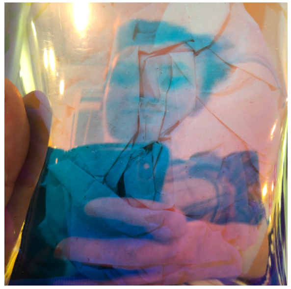
Pearlescent airbrushing Iridescent mirroring

Ideally, MOOD should run on solar energy, thus retaining energy from the sun at times when we can't see it and re-releasing 'sun light' and warmth to visitors when they need it, while doubling as a space (and even shelter) for social interaction. This adds to the sustainability of the sculpture and allows it to be installed without access to power outlets (visible power outlets also breaks the illusion). Solar energy is preferable to other renewable energy sources for the poetic quality that the retainment and transmission of sun light adds to the project.