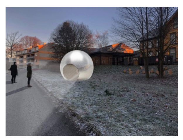
Useful MOOD mode #2 Digital sketch for LevArt PARK

Placing the sculpture in public space and to have strangers interact inside of it is an integrated part of the concept of this project. I currently have two opportunities to exhibit the sculpture in public space when the COVID-19 situation is over. Unfortunately, due to the situation, it will not be experienced in a gallery setting as an extension of this thesis, as first intended. In any case, the idea is to add a question of translatability of an art work between different settings and is something I have explored in several of my works.