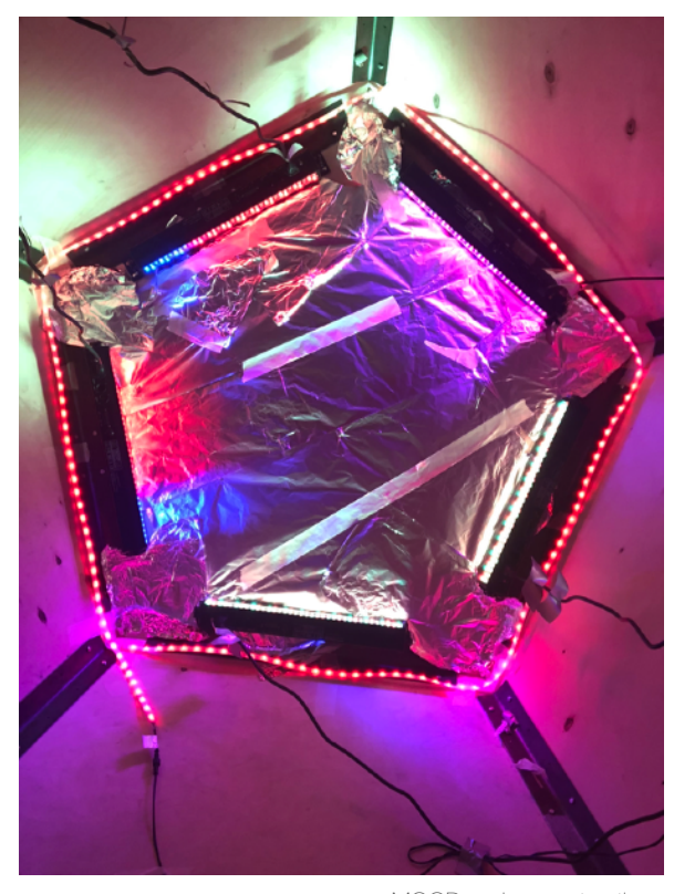
MOOD under construction Experiments with light

While visitors to the coffee houses often would share an interest in politics (the coffee houses became public arenas for political debate) and guests at the pilgrim pavilions would often be religious travellers, both places were sites for questions, gathering and debates among people who often didn't already know each other.