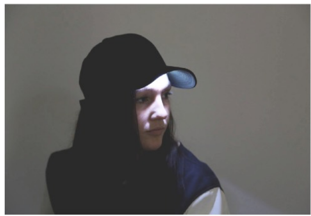
Early artworks concerned with light and light therapy Bag Full of Sunshine (2014), Therapeutic Lighting Cap (2015)