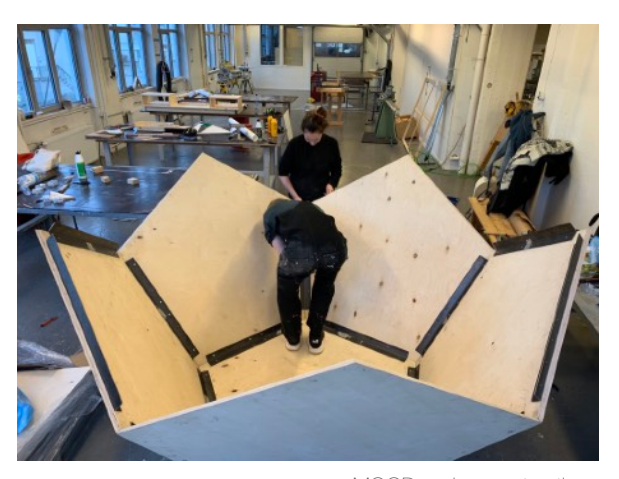
MOOD under construction Dimensions and technique.