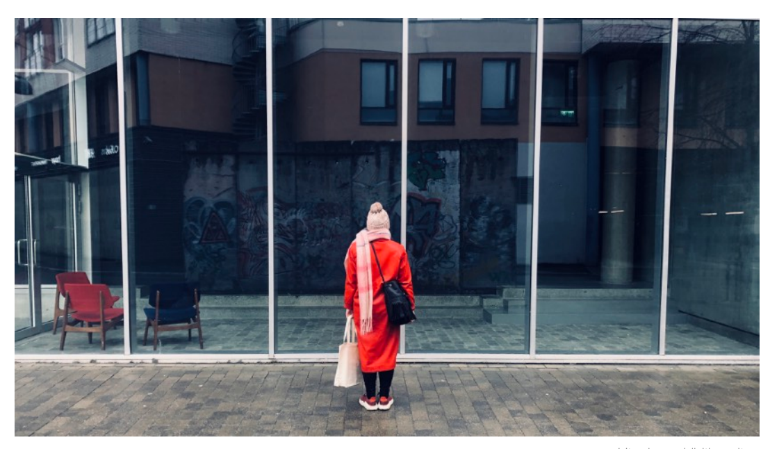
Utopian exhibition site TKM Gråmølna, May 2020