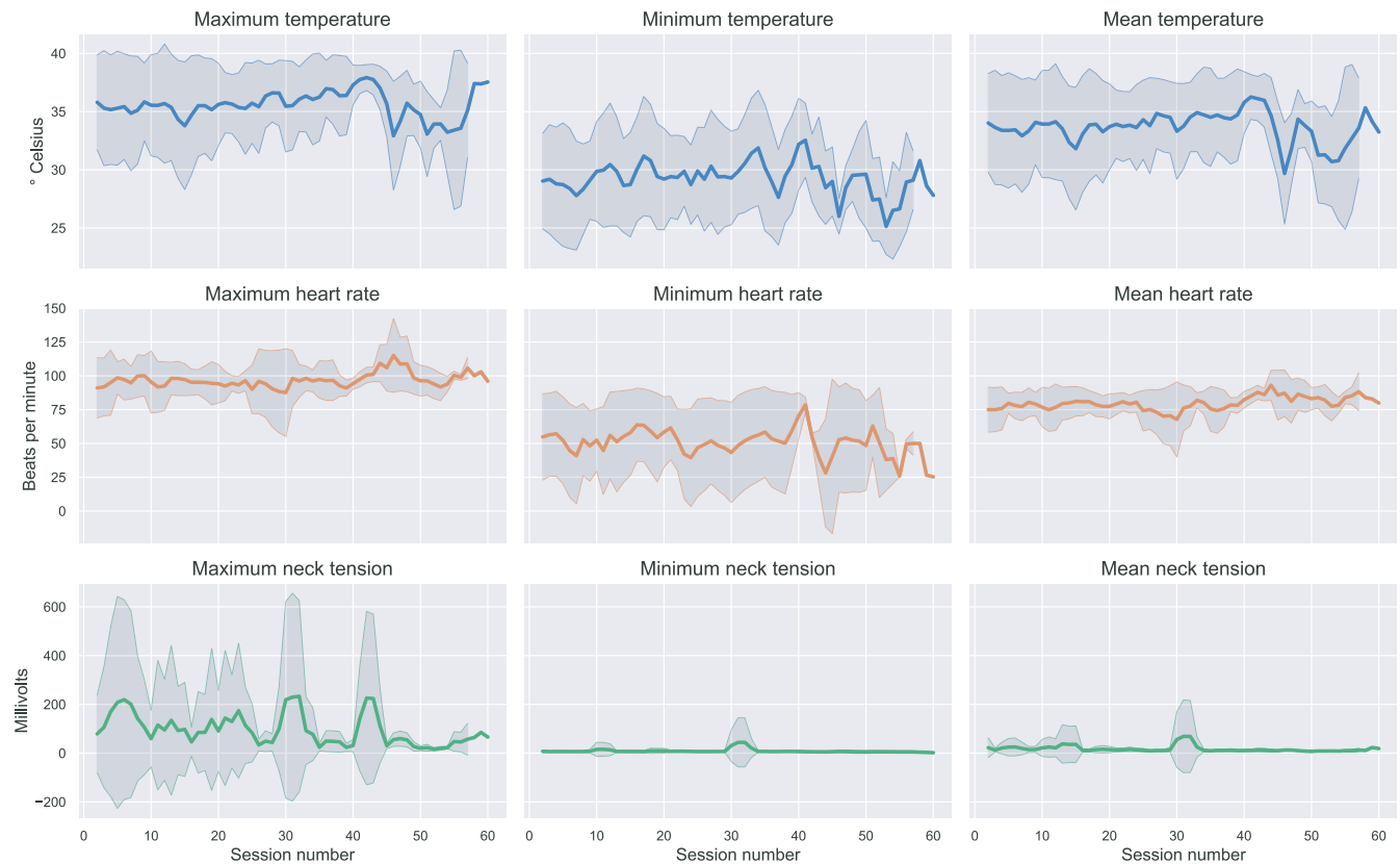
FIGURE 2 Visualization of raw physiological data over the course of all biofeedback sessions for patients in the verum group. The thick lines represent mean raw physiological value averaged over a moving window of three sessions. The shaded gray area represents the corresponding moving average of one standard deviation from the mean. Note the slight increasing trend in finger temperature, and slight decreasing trend in minimum heart rate and maximum muscle tension up to session 40. The number of participants completing more than 40 sessions was low, thus yielding the highly variable trends in session 40–60

option, provided significant alterations to the treatment setup and study design are made. Future iterations of the intervention should include a more comprehensive intervention and ensure increased adherence through means such as gamification. Future studies of the intervention should strongly consider a noninferiority study design with an active comparison group and be powered to detect small, but clinically relevant, treatment effects.