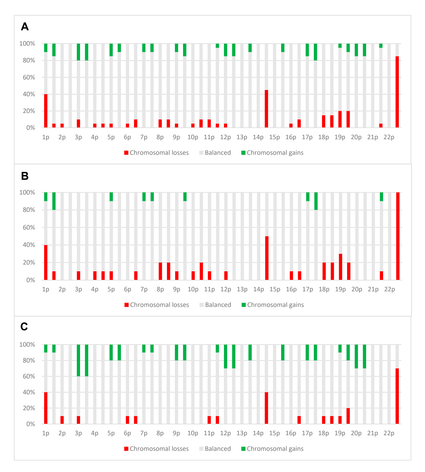
Figure 3. CNV profiles from methylation profiling data of all 20 cases ( A ) and profiles of cases distributed on group I ( B ) and group II ( C ), respectively.

The CNV profiles derived from the NGS data were far less sensitive to detect the CNVs in the cases compared to the 850k data due to limitations in coverage of panel sequencing. Yet, 22q loss based on coverage of NF2 was estimated in 75% of cases by NGS, supporting the findings on 22q status from the 850k data.