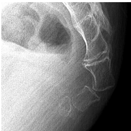
Figure 1. Radiograph showing subluxation of Co2.