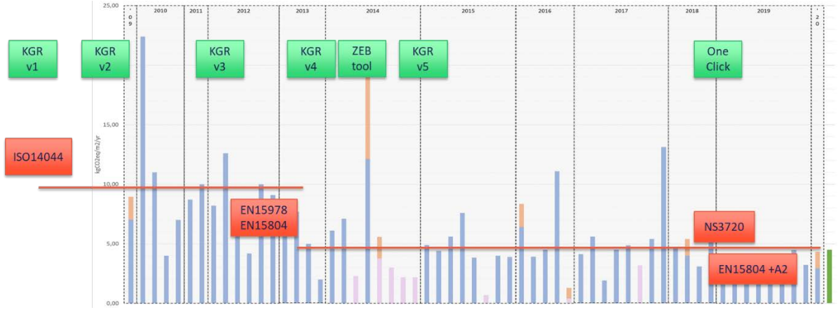
Figure 1: Embodied GHG emissions for life cycle modules A1-A3 (blue) and B4 (orange) in the as built phase in chronological order. All case studies from Futurebuilt have aggregated embodied material emissions into one score (blue). Renovation projects are shown in pink. The average for all cases is shown in green.