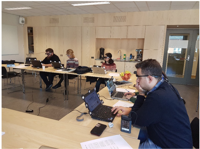
Fig. 1 Experiment set-up with mobile eye-trackers