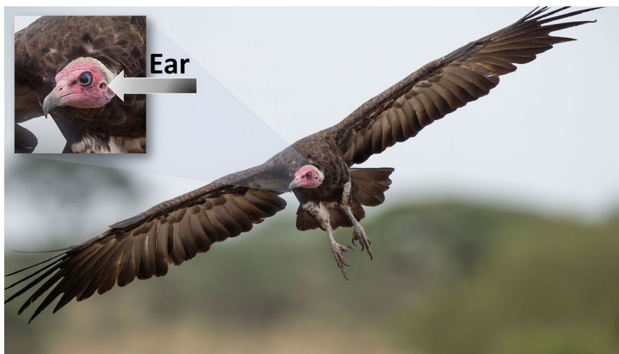
FIGURE 2 More to it than meets the eye: the ear. A hooded vulture coming in to land, its large eye and ear clearly visible. Although the role of auditory cues in the foraging ecology of avian scavengers has been disregarded to date, we recorded numerous responses to our playback surveys where sound was the only possible cue upon which these birds could act.

By comparison, the other three vulture species only arrived first in a total of 13 sessions. While variability in species density is likely to influence this, temporal segregation occurs among avian scavengers and time of day and may too be a particularly important factor (Kendall, 2014). Our call-in stations were conducted soon after sunrise, when ambient temperatures were still relatively cool. The hotter periods of the day are associated with greater thermal updrafts, and optimal soaring conditions typically occur between ca. 11:00 and 16:00 (Pennycuick, 1973). Avian scavenger species with heavier wing loads, that is, body mass to wing surface area ratio, are unable to soar during the cooler morning hours (Kendall, 2014; Pennycuick, 1973). Pennycuick (1973) assessed wing loading values in ten species of soaring birds, all of which occur in the Serengeti ecosystem and found that two groups emerged: a light wing loading group and heavier wing loading group. The four species included in the light wing loading group were the tawny eagle, hooded vulture,