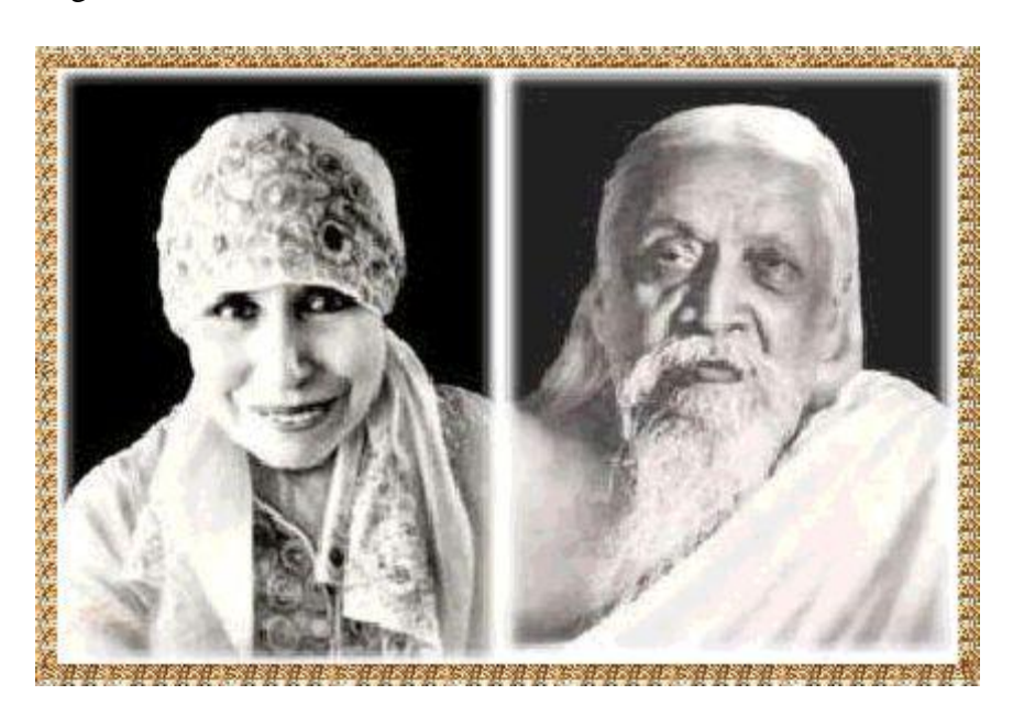
Figure 1: The Mother and Sri Aurobindo.

It was the Mother who organized the growing group of followers around him into the Sri Aurobindo Ashram in November 1926. Sri Aurobindo passed away in 1950, and in 1952 the Mother created the Sri Aurobindo International Centre of Education to fulfill his wish of providing a new kind of education for Indian youth. In 1968 she founded the international township project of Auroville as a yet wider field for practical attempts to implement Aurobindo's vision of new forms of individual and collective life, blazing the trail for a brighter future for the whole world.