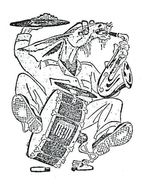
Illustration 1: The Jazz Musician in the Communist Press<sup>28</sup>

The social impact of jazz as a performative cultural practice in Communist Hungary, as anywhere, is difficult to gauge. In the United States, the history of jazz is inextricably entwined with the history of race relations. Since its invention by African Americans in the early twentieth century, it has been commodified and often appropriated by dominant white culture. Subsequent innovations in jazz, formulated as deliberate rebellions against the "square" mainstream, are themselves often eventually co-opted in turn.<sup>29</sup> Jazz has served both revolutionary and hegemonic ends: against the indictments of