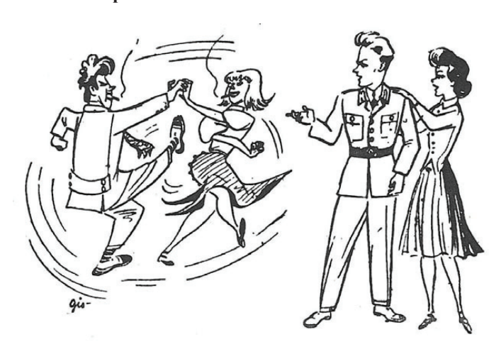
Illustration 2. Two Couples at the Dancehall

Accounts of hooliganism in the 'popular' press reveal just how closely cultural life in communist Hungary was monitored, and the significance of this deviant youth stereotype as a means of social control. Youths with jampec hairstyles or clothing were not allowed in the more class-conscious dancing schools ( tánciskolák ) feted in Esti Budapest ; trying to sneak in one or two swing steps or other risqué moves were adequate grounds for getting kicked off the dance floor. Factories, workers' hostels, bars and dancehalls were also under regular and intrusive surveillance; this intimate policing of the social sphere extended to noting even the faintest transgressions in clothing, hairstyle, or