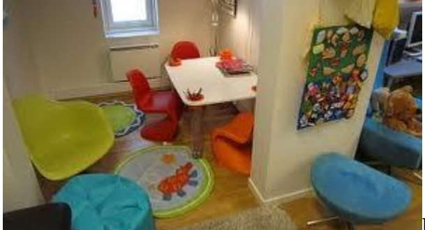
Figure 2: Picture from a waiting room at SB. Toys, furniture for children is observed making it more child friendly.

Figure 1: Picture of an interrogation room at one of Sb houses with a comfortable environment, you can see the fur on the chair.