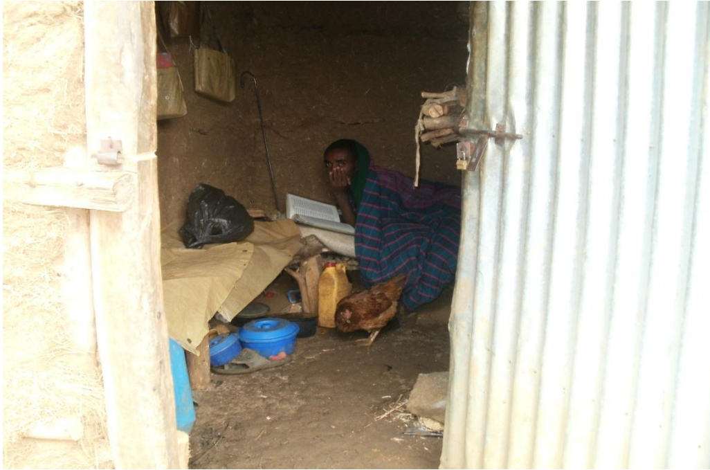
Figur 5 Yek'olo-temari child along with his hen inside his room while studying