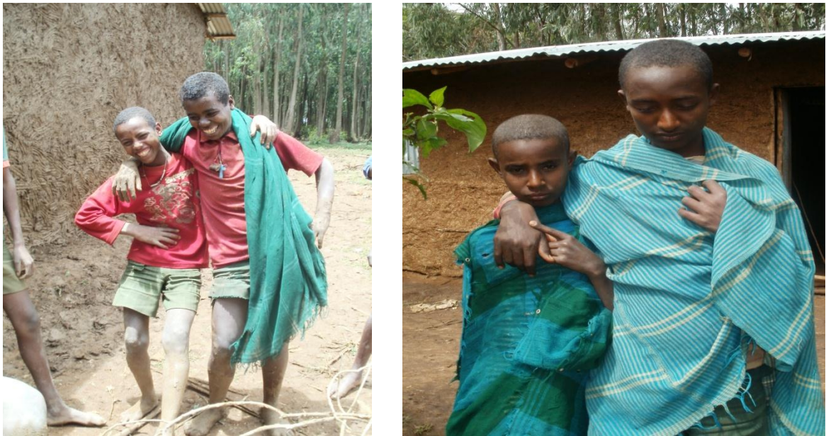
Figur 7 Yek'olo-temari children in the school with their friends

Children's ways of spending their time with their peer tend to be different from other children outside the school. They explained that they sit and discuss in their spare time. "Play" is not the major part of their peer relationship. From behavior point of view, there is no clear demarcation between "child" and "adult" in the school. Both the adults and the children show predominantly similar behavior of being formal and calm. The conservative nature of the religion, Yeneta and the school environment might have significant influence.