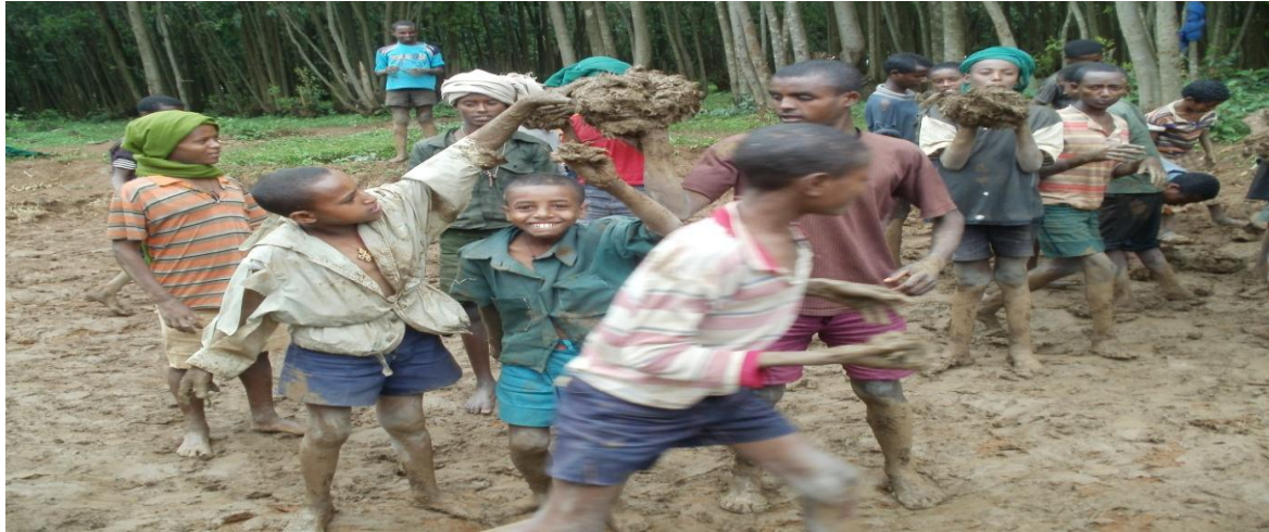
Figur 10 Children taking mud to fix to the house