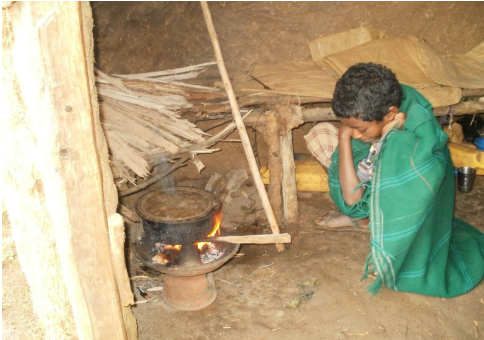
Figur 3 cooking time

Dirkosh is dry and to make it fresh I boil water, add some salt, berberie (red hot chili). If have money, I sometimes I add onion and oil. When you cook it like this, it became soft (Yibeltal , boy, 13).