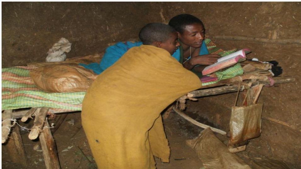
Figur 8 A higher level student scaffolding the lower level student

According to him, if he taught all of the 80 students in the school, the students would not have studied the lessons in-depth orally. When students are assigned, one higher level student can teach few lower level students. This tradition, he said, help the students study very well. As I have witnessed during field work, I saw higher level students teaching lower levels. This implies that, student-teacher, is one of the characteristics of vertical peer relationship.