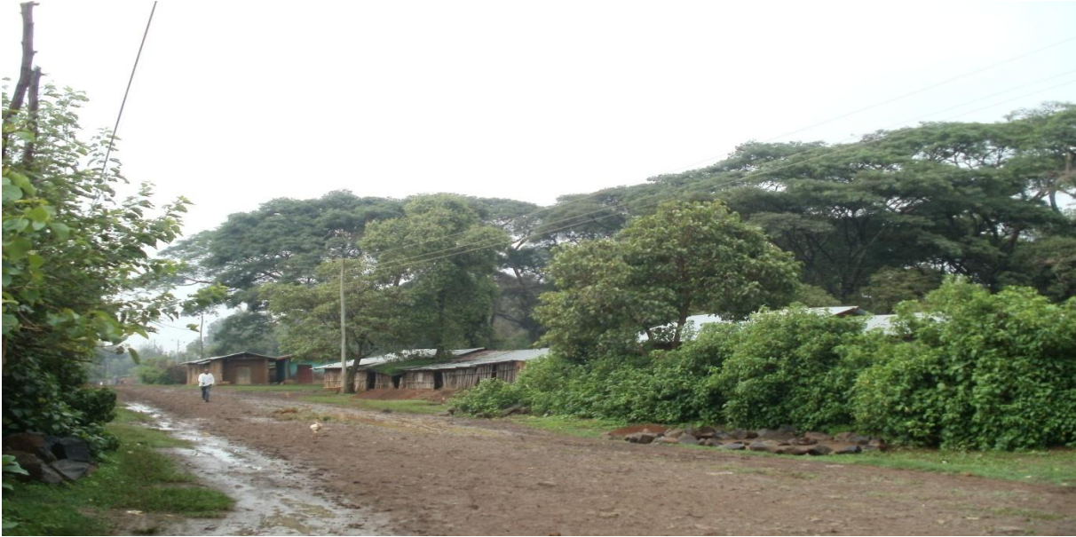
Figur 2 The school surrounding the church