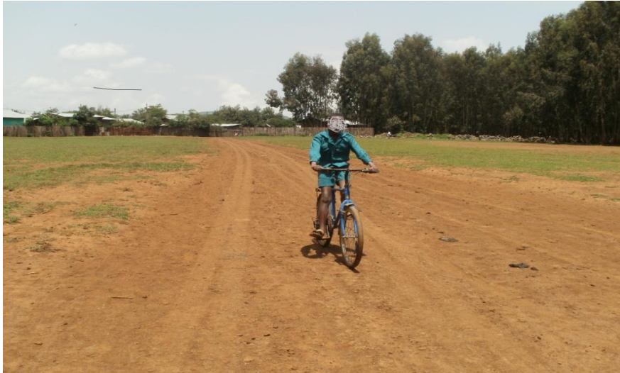
Figur 6 Yek'olo-temari child riding bicycle

Three major issues can magnify the child's negotiating ability. One, the child came from the rural part of Gojjam where there may not have an access even to see the bicycle. Two, children are expected to devote most of their time for the education and they are not expected to do this kind of activity outside the school. Three, the child do not have an access to the bicycle. In our informal conversation after the cycling, the child told me that he managed to learn cycling by paying 50 cents for training of five minutes in the town. He told me that, he tried his best to hide himself from other students and the teacher. In this way, he does his interest without losing his harmony staying in the school.