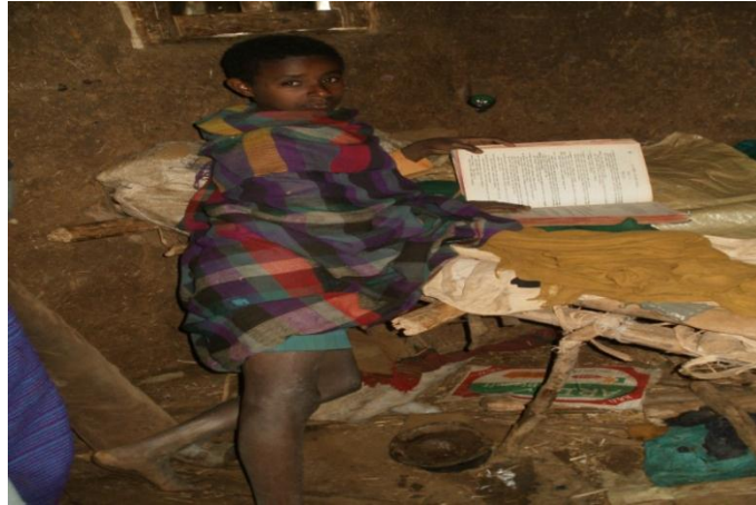
Figur 9 Yek'olo-temari child reading on his bed made by older student from local wood

To sum up, even though the participants of this study are children with the age of 15 and less, the age of the students in the school is diverse. As students study and live in the school, children's social relationship with the older students is the important part of their life that deserves attention. The relationships between children and older students have different characteristics. Primarily, inter-dependence dominates the vertical peer relationship. Older students help children to adjust with the life in the school by giving guidance and support in their educational and daily life. Children also give their own reciprocity for the help and support they receive from the older students. Obedience also characterized the vertical peer relationship. This might be stemmed from the religious and cultural practices and values that encourage obedience and respect for older persons or persons with high social status.