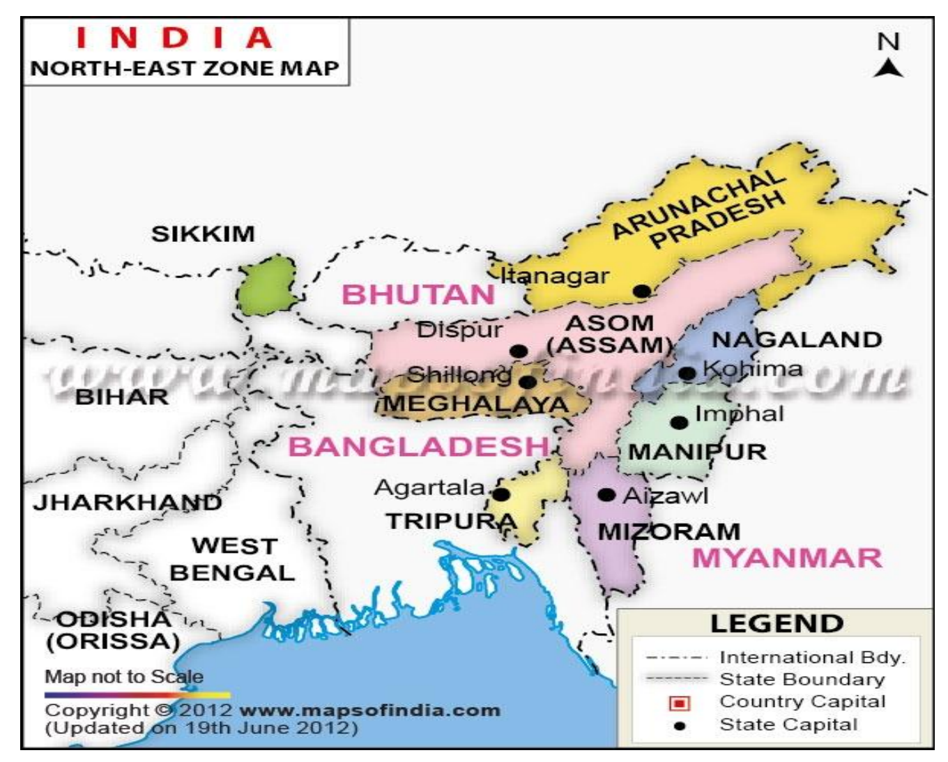
(Maps of India 2013b).