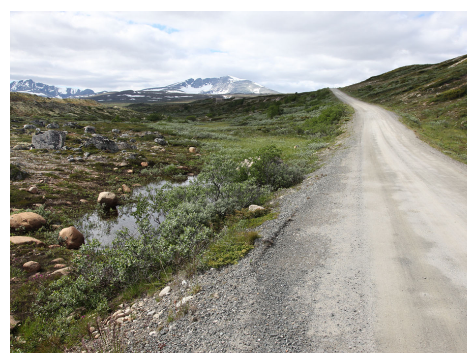
Figure 2. The road to Snøheim in Dovrefjell (looking north-west), with Snøhetta in the background.

respect, there are long traditions of cooperation at the local level between different actors and public management, as well as active participation by individuals and organizations.