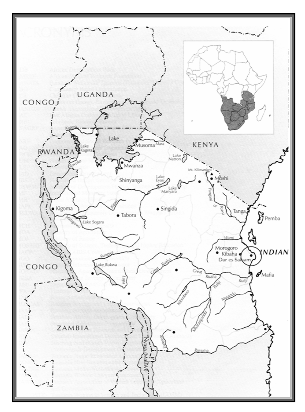
Map 1. Tanzania, East Africa