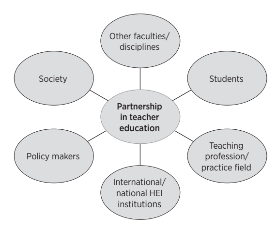
Figure 1. Partnerships in teacher education

Higher education institutions are commonly perceived to be the primary agent for preparing teachers and thus have the overall responsibility. This is, however, changing, and teacher education institutions are expected to establish partnerships with other stakeholders, as suggested in EU documents, such as Supporting Teacher Educators (2013) and Strengthening Teaching in Europe (2015). Both documents convey a clear call for cooperation. Furlong et al. (2000) and Darling-Hammond (2006) argue that teacher education needs to form strong relations with agents inside and outside academia, and especially on the practice field. It is argued in this paper that teacher education might be strengthened if teacher education institutions form partnerships with a number of stakeholders, as illustrated in Figure 1.