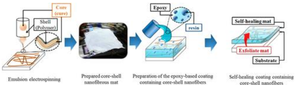
Figure 2: Preparation of core-shell nanofiber via emulsion electrospinning method for fabrication of a self-healing epoxy-based coating. Adapted with permission from Lee et al<sub>25</sub>

emulsion electrospinning 25 , 26 and coaxial electrospinning. 27 Self-healing properties of epoxybased 25 and silicone-based coatings 26 , 27 were studied by this group. Figure 2 schematically presents the encapsulation of healing agent via emulsion electrospinning and development of epoxy-based coating.