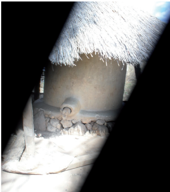
Figure 6: Photo showing granary made of cement

The materials used in the construction of the granary made of local materials are sourced from the environment at no cost. The materials include poles from trees, bamboo, grass, and clay soil for plastering. To keep termites away, farmers spray the poles with termite repellent or paraffin or diesel. In most cases such granary are made by the owners themselves.