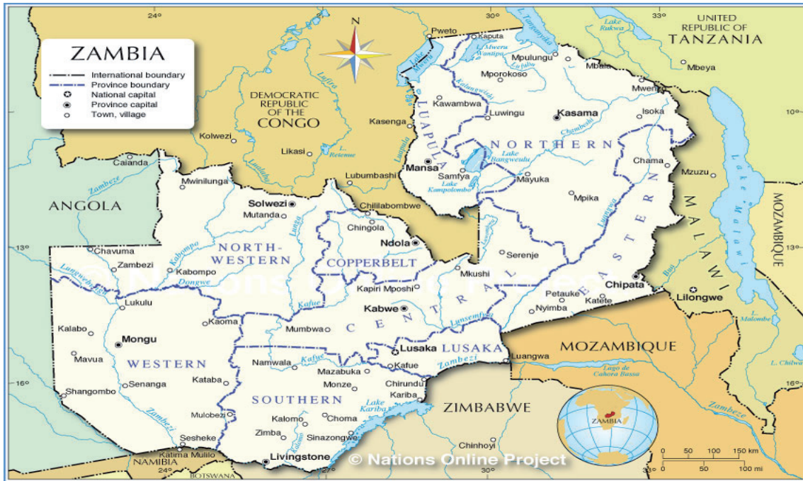
Figure 1: Administrative Map of Zambia

Nyimba is one of the districts in the eastern province of Zambia. Thus Nyimba district being part of the eastern province is a good example of a place suitable for the study which was undertaken as it gives a good picture of the salient characteristics relevant for the study.