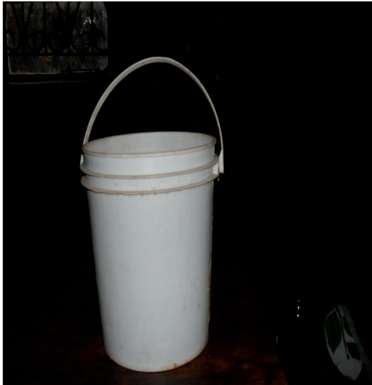
Figure 7: Meda Container