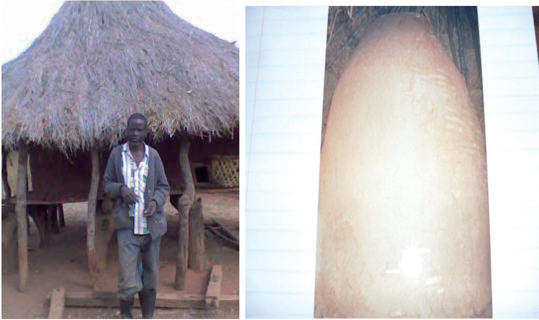
Figure 5: Photos showing granary made from local materials