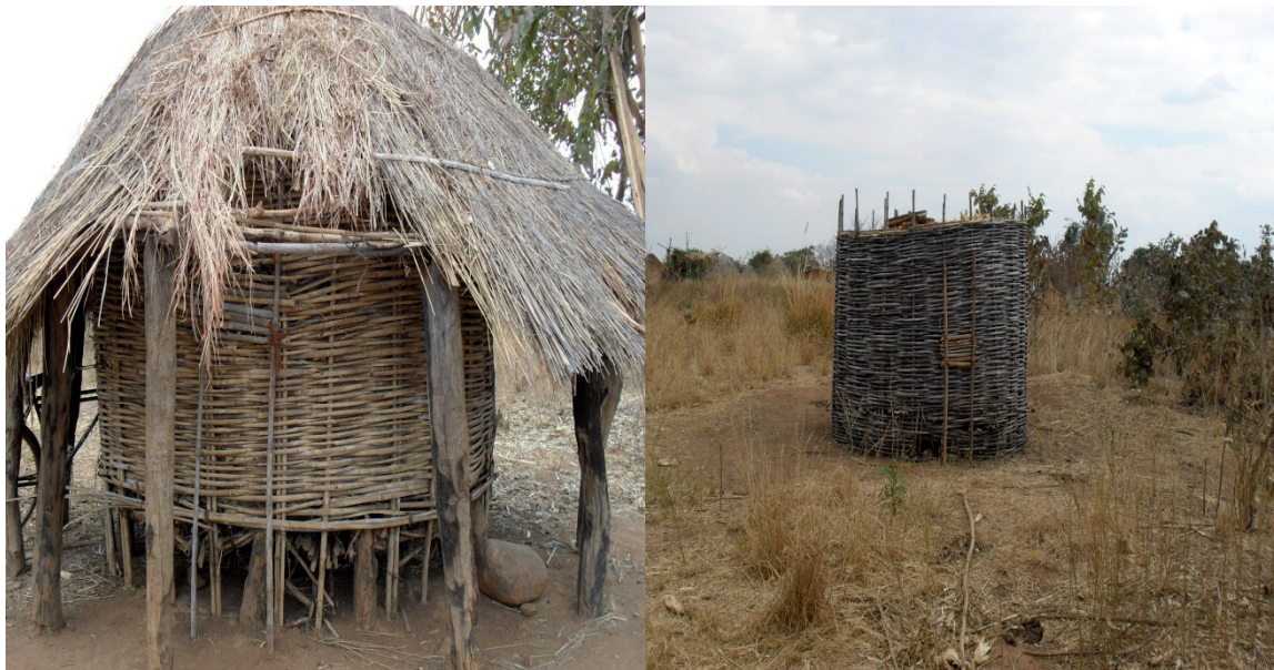
Figure 4: Photos showing traditional barns

in Figure 4 are typical examples of the traditional maize barns. The traditional barn on the right in Figure 4 is not roofed to allow for further drying of the maize after harvesting