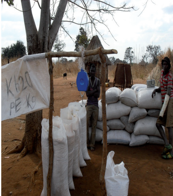
Figure 9: Photo showing Maize Buyer at Private Maize Buying Point

The whole of Nyimba district had eight satellite depots where the government through the FRA was buying maize from the SSFs. In fact the number had been seven but was raised to eight in the 2009/2010 marketing season. In 2009 Nyimba district had approximately 15, 000 households (MACO official). One camp extension officer’s comment on the issue of markets was ‘market is difficult because we have few markets but very many farmers and the distance to the marketing areas is too far.’ His comment suggests that there is a relationship between the number of satellite depots and the distance the SSFs have to travel to get there. In addition, he said the SSFs in his camp who were farthest from their nearest satellite depot were located about 20km away. Commenting on the issue of markets, an official from NDFA said ‘the government market itself is not enough and is far from where the SSFs stay’. He too attests to the problem of few government markets and long distance to the same. Most of the SSFs interviewed did not know the exact distance to their nearest satellite depot. For example, one SSF’s response to the question about distance to the market was ‘it’s a long distance, we don’t know how many kilo metres it is, but what we know is that it’s very far’. SSFs who were located far and could speculate the distance where located about 7 – 10km