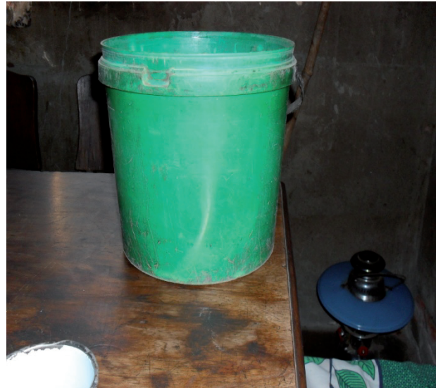
Figure 8: Photo of Dunavant Container