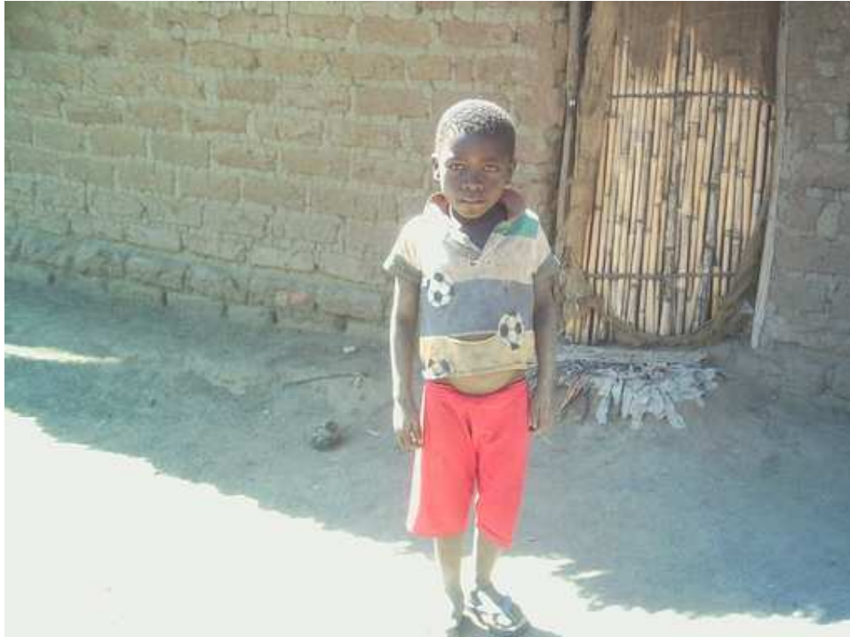
Figure 12: A sponsored child; the mother says he has limited clothing.