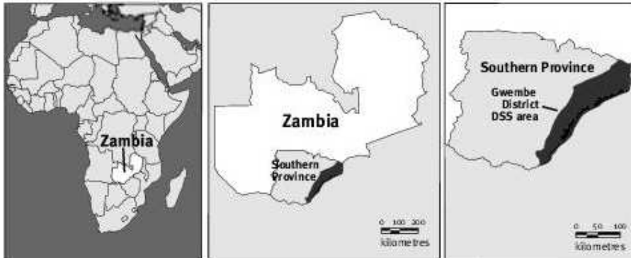
Figure 4: Geographical location of the Gwembe District