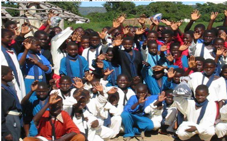
Figure 11: Children receiving Clothes as Gift In Kind

It was also explained that besides being the main funding source for all ADP activities, child sponsorship also offers direct support to all CIPs. Although it is envisaged that the benefits from other sectors will eventually trickle down to all CIPs, it is recognised that there are also more specific needs of the children hence the direct support component under this sector. This includes meeting CIP basic needs like health, food, clothing, shelter and any other as may be dictated by the circumstances. A Customer Relations Service Worker (CRS Worker 17 ) under the ADP explained that the ADP pays for; medical fees for any CIP who falls sick and requires specialised treatment, school fees and other school requisites for all school going CIPs, and periodically distributes clothing to all CIPs and gives food rations to families with CIPs in the face of hunger. All such direct support is made as a way of contributing towards meeting the context and area specific children's basic needs. Figure 11 below show World Vision sponsored children at Bbondo zone receiving clothes as GIK.