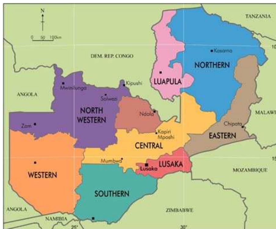
Figure 1: Zambia's geographical location, neighboring countries and provincial boundaries