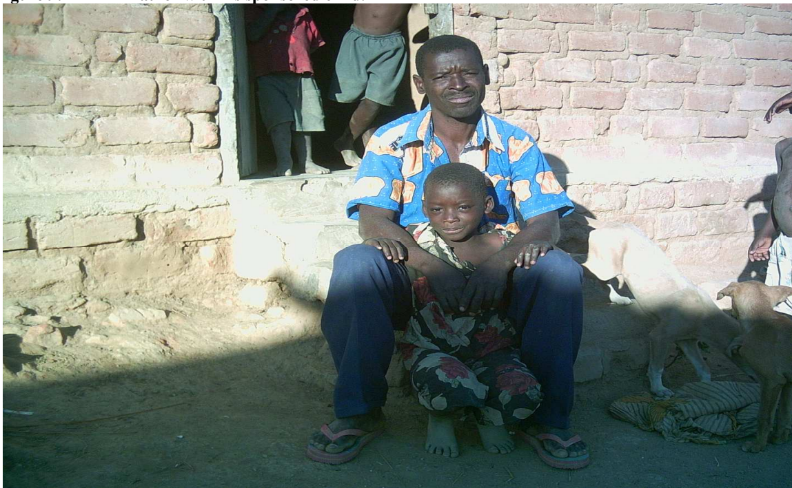
Figure 9: A father with his sponsored child.

The above parent was of the view that the CDP approach was better than the current ADP approach