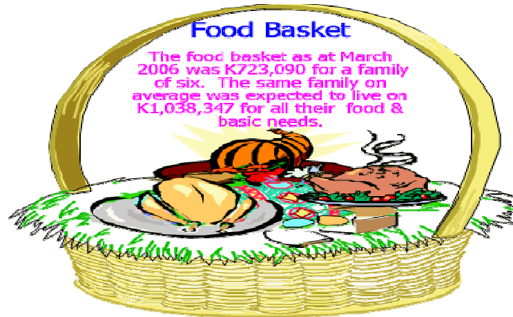
Figure 3: Monthly Food Basket as a measure of poverty line

Note that the above food basket is a latest measurement; as at 2000 National Census the definition of what constituted the food basket and consequently basis for determining the country’s poverty rate was based on minimal caloric requirement (vegetarian) and excluded meat, chicken and fish. It also did not factor in non food needs.