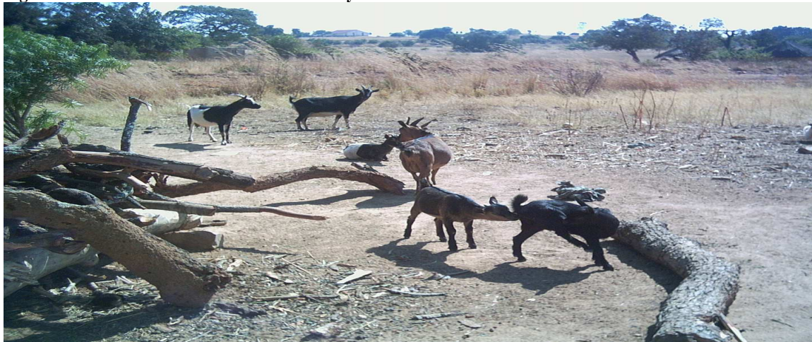
Figure 10: Some Goats in the community

Some of the above goats are children's benefits under the livestock restocking project of the ADP.