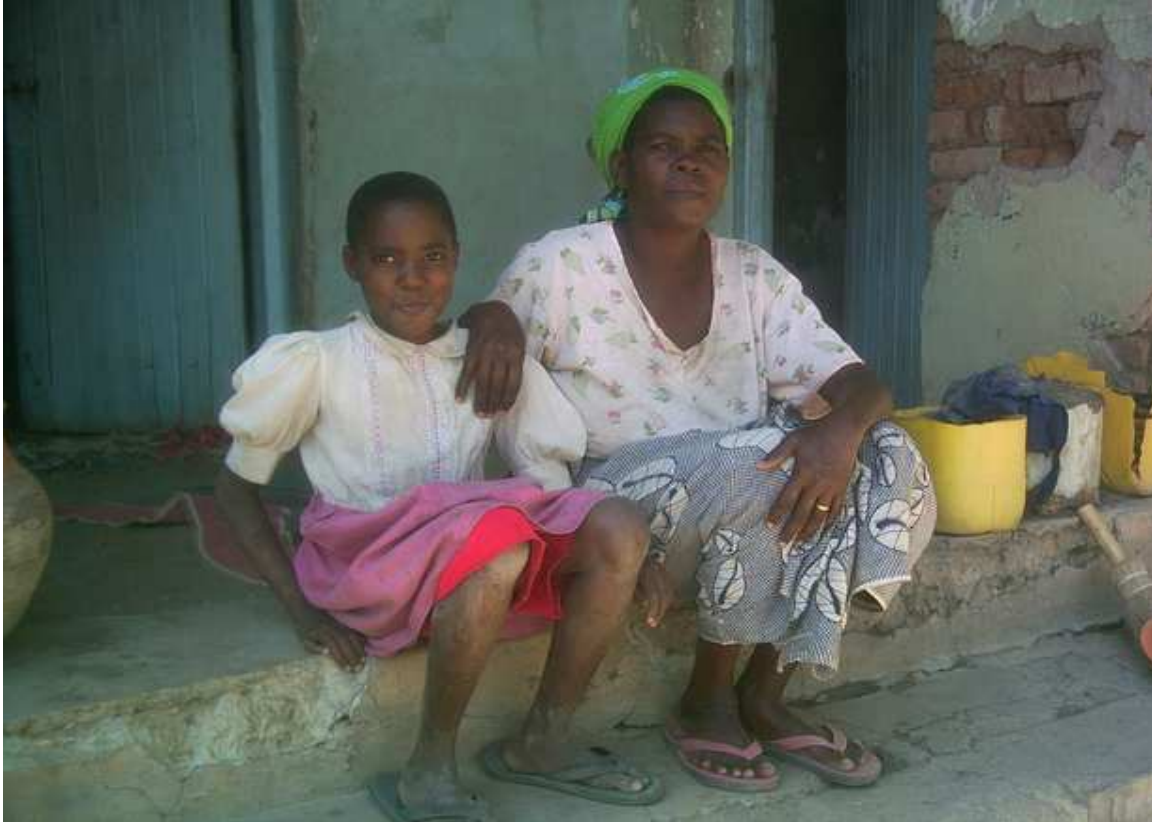
Figure 8: A mother with her World Vision sponsored child.

The above child suffers from epilepsy and the mother says it is now easy for her child to access medical care from the nearby RHC.