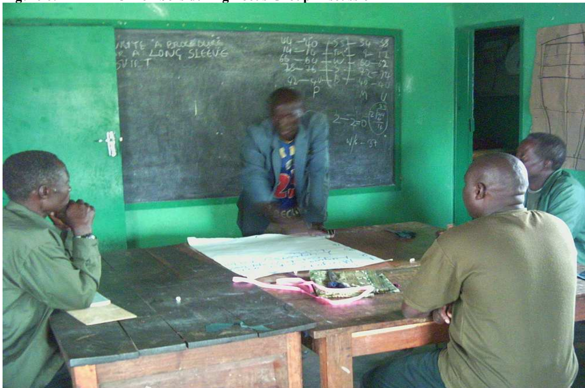
Figure 6: PMC members during Focus Group Discussion

During the discussions I closely moderated the groups to ensure participation of all group members and also to ensure that the discussions were within the given guidelines. Each group's views were subjected to a further discussion in plenary which either reconfirmed such views or brought in additional information.