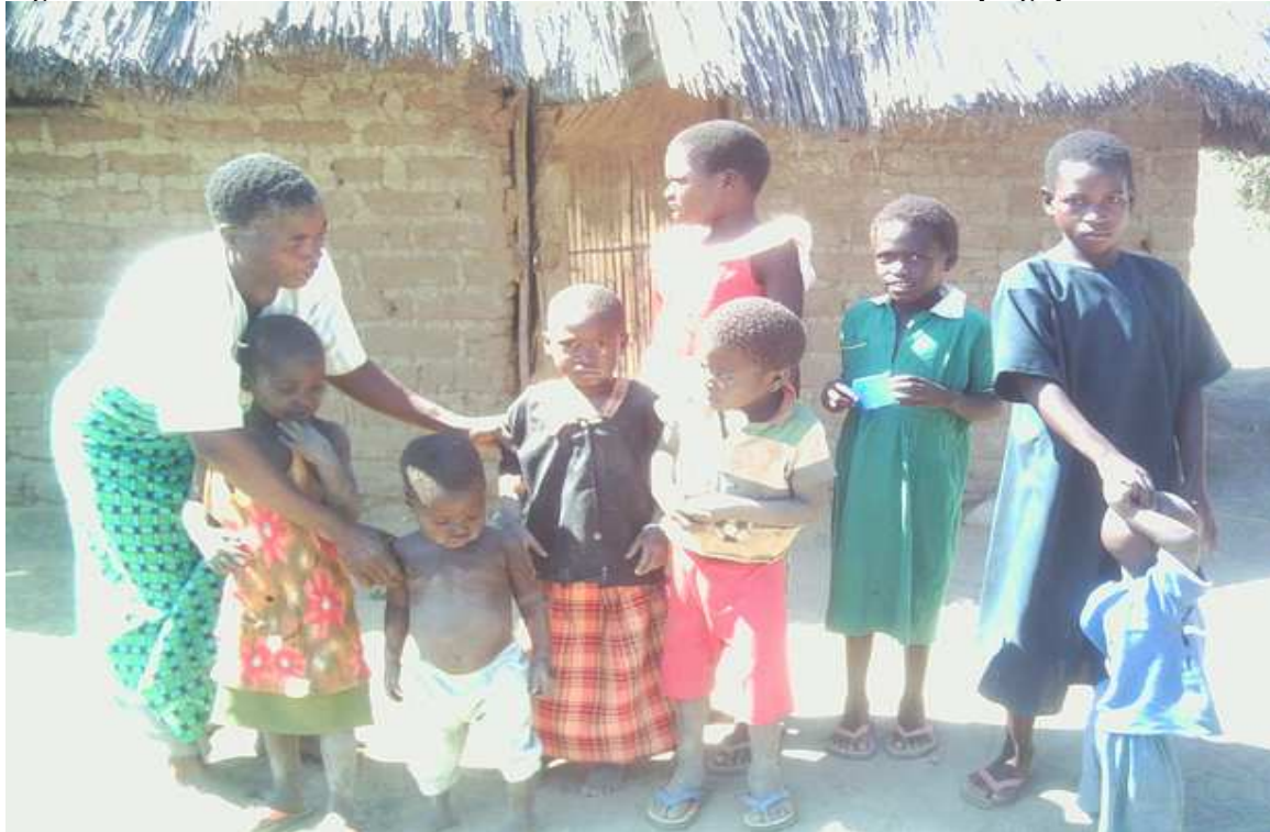
Figure 7: A mother with children under her household who share sleeping spaces

Figure 7 below for example shows a mother and several children under one household who share sleeping spaces.