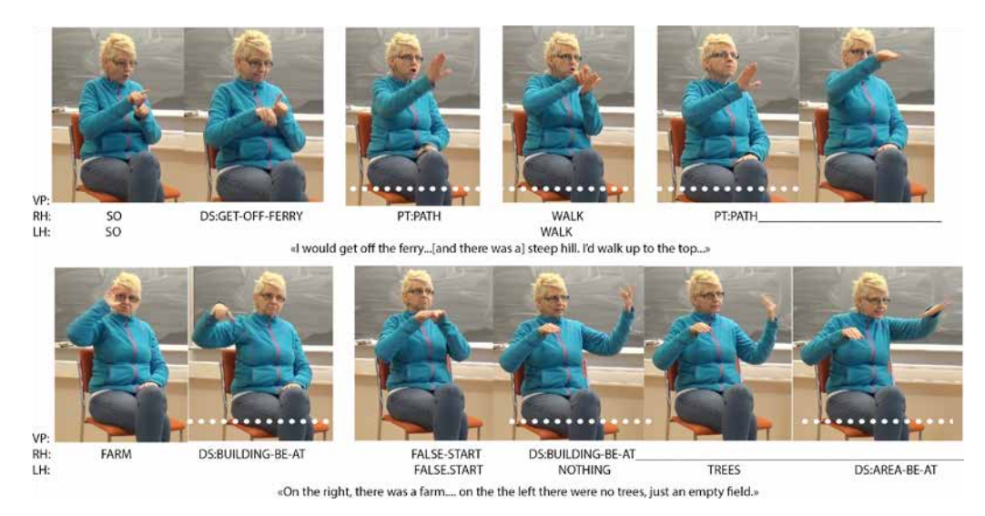
Figure 5: An example of a signer depicting from an internal, mobile vantage point (DPNTS_TR_HKO.eaf, 00:17:08.15-00:17:18.627).

Signers across the study corpus were observed to engage internal, mobile vantage points, and such instances align with what has been described as a route perspective in the literature. These cases were slightly more frequent than internal, static vantage points, which are discussed in the next section. To begin here, an example of an internal, mobile vantage point combination is provided in Figure 5.