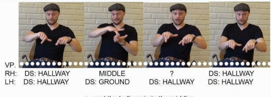
«...and the hallway is in the middle»

Figure 1: A signer depicts a hallway in a building from a vantage point that is static and external to the conceptualized scene, i.e., observer perspective (DPNTS_0_PN.eaf, 00:35:50.100-00:35:52.688).<sup>1</sup>