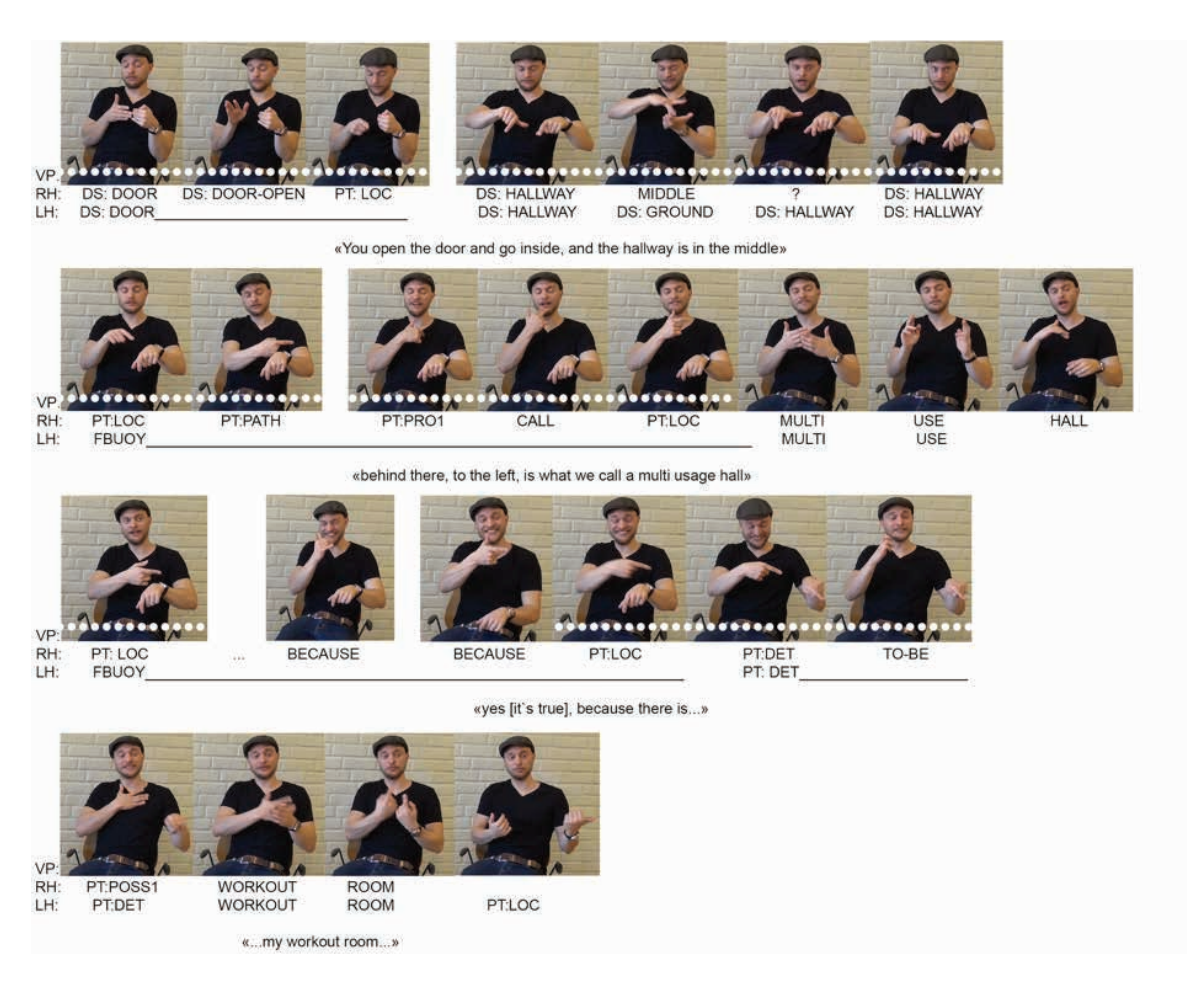
Figure 3: A signer depicting his apartment from an external, static vantage point (DPNTS_O_PN.eaf, 00:35:48.298

An example of such a vantage point is presented in Figure 3 as a signer describes the layout of his apartment. He begins by depicting the opening of a door and then points into the open space (see the first three images from the left on the top row in Figure 3). These initial signs might at first suggest an internal vantage point. However, considering that the signer's eye gaze is directed at his hands and not at objects and locations he himself would encounter as he entered the apartment, as well as that he depicts a door with his hands and not, for example, as a person holding and opening a door handle, leads us to interpret this initial utterance as establishing an external vantage point.