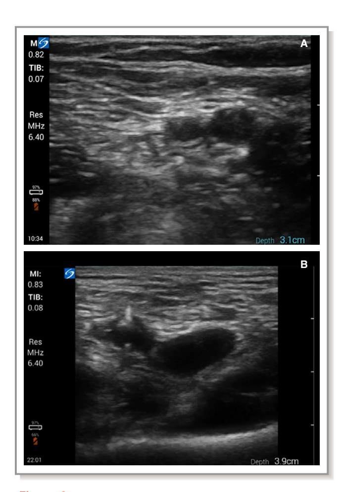
Figure 3. Ultrasound images from femoral cannulation site. A , A small artery (left) close to a larger vein (right). B , A greatly dilated vein (right) and a small artery (left), the guidewire is visible entering the artery.

aortic zone 1.28-30 Such calculations are not likely to be performed in an out-of-hospital scenario. We used a set length of guidewire and balloon catheter placement and found this to be adequate in the pre-hospital setting. Second, ultrasound was used to avoid venous placement of the guidewire. Venous balloon inflation would decrease preload and must be avoided. The cannulation success rate found in this study implies that a structured training program and mandatory use of ultrasound<sup>22</sup> can provide a high cannulation success rate in patients receiving CPR in the pre-hospital environment. This observation agrees with reports from extra-corporeal membrane oxygenation cannulation during cardiac arrest in the emergency department.31 Third, we used a non-compliant, 20mm balloon, with an occlusion length of 30 mm. The descending aorta in the age span of eligible patients is pprox25 mm of width. 32,33 Using a 20-mm balloon provides a nearly total obstruction of vascular volume without the risk of aortic rupture due to an oversized balloon, as earlier reported.<sup>34</sup> Fourth, a simple pulse check in the left radial artery was performed in this study. A present radial pulse