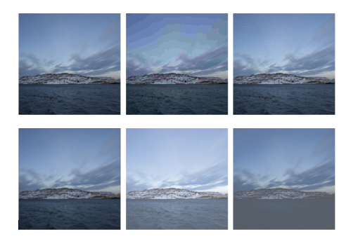
Fig. 3. Samples of the CID:IQ dataset

computed after a nonlinear mapping [25]. The correlation coefficients were computed between subjective scores for both viewing distances and the corresponding predicted values. A correlation equals to 1 means a perfect prediction, while a correlation equals to 0 indicates no correlation.