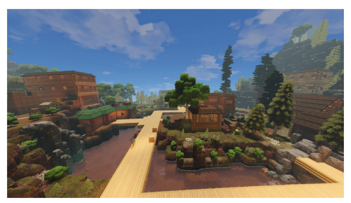
Example of a player-generated base society in Eco. Note the pinkish water – one of the indications that it is polluted. Image used with permission.