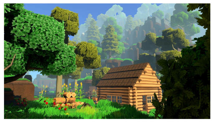
Example of a player-generated house from Eco, as well as the game's user interface (UI). Note the stacked wooden logs in the left of the picture, used by the players to make a variety of in-game structures. Image used with permission.

Eco is an online simulated ecosystem game developed by Strange Loop Games, funded by the United States Department of Education (IES, 2015; Strange Loop Games, 2018b) and an online crowdfunding campaign (Kickstarter, 2015). The game's main objective is to stop a giant meteor from crashing into the surface of the earth, which is set to strike after a fixed time period of 30 real-life days (Meteor, 2018). While developing the requirements for stopping the meteor, players also cause pollution which needs to be minimized so that the ecosystem can continue to thrive – a measure of which can be found in an in-game statistical overview available to the players. In other words, the players need to destroy the meteor as well as maintain balance in the virtual ecosystem that the game provides them with.