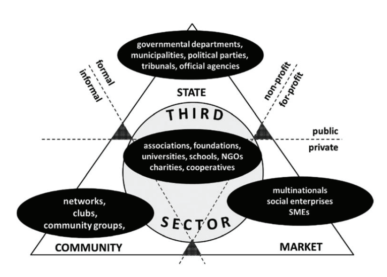
Figure 1: Multi-actor governance structure model [8]

To illustrate the governance structure, i.e. the way actors stand in a network and interact with each other, this paper adopts Avelino and Wittmayer's [8] Multiactor Perspective (MaP) which is developed to understand transition politics by focusing on shifting power relations. In this model, (figure 1), the functionality,