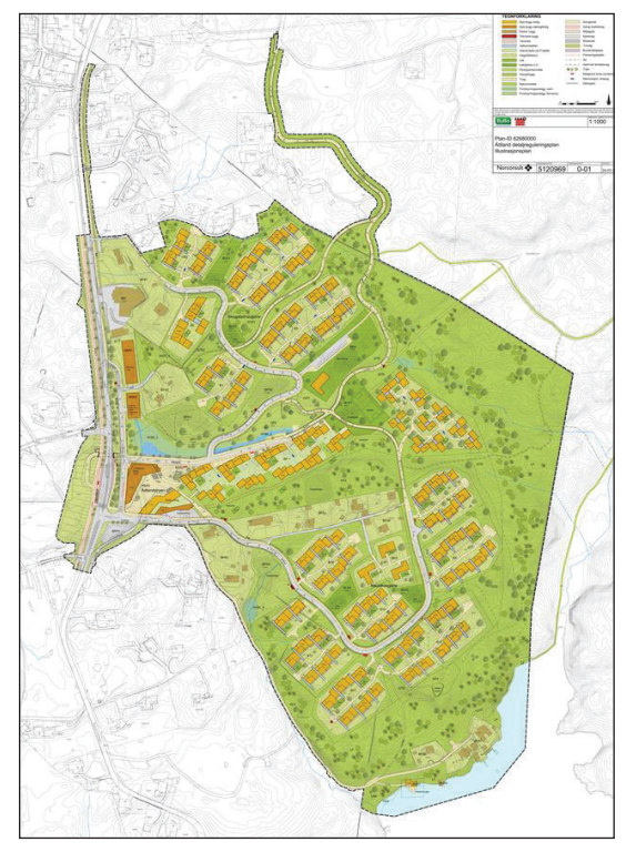
Figure 2: Illustration plan for Zero Village Bergen*

i.e. the actors' interactions are seen along the three axes: (1) informal-formal, (2) for profit-non-profit and (3) public-private. Similar to the quadruple helix, actors are structured in four actor categories; 1. State; 2. Market; 3. Community; 4. Third sector, which universities/academia belong to. A rationale behind the choice of MaP is its deep attention to the role and power of the university as a social entrepreneurial and cooperative organization, conceptualizing an intermediary between the three others [8] In this model, sectors are not fixed entities, indeed the boundaries between them are contested, blurring, shifting and permeable[8]. In addition, an actor can be a person, organization, or a collective of persons and organizations, which is able to act [8, 9].