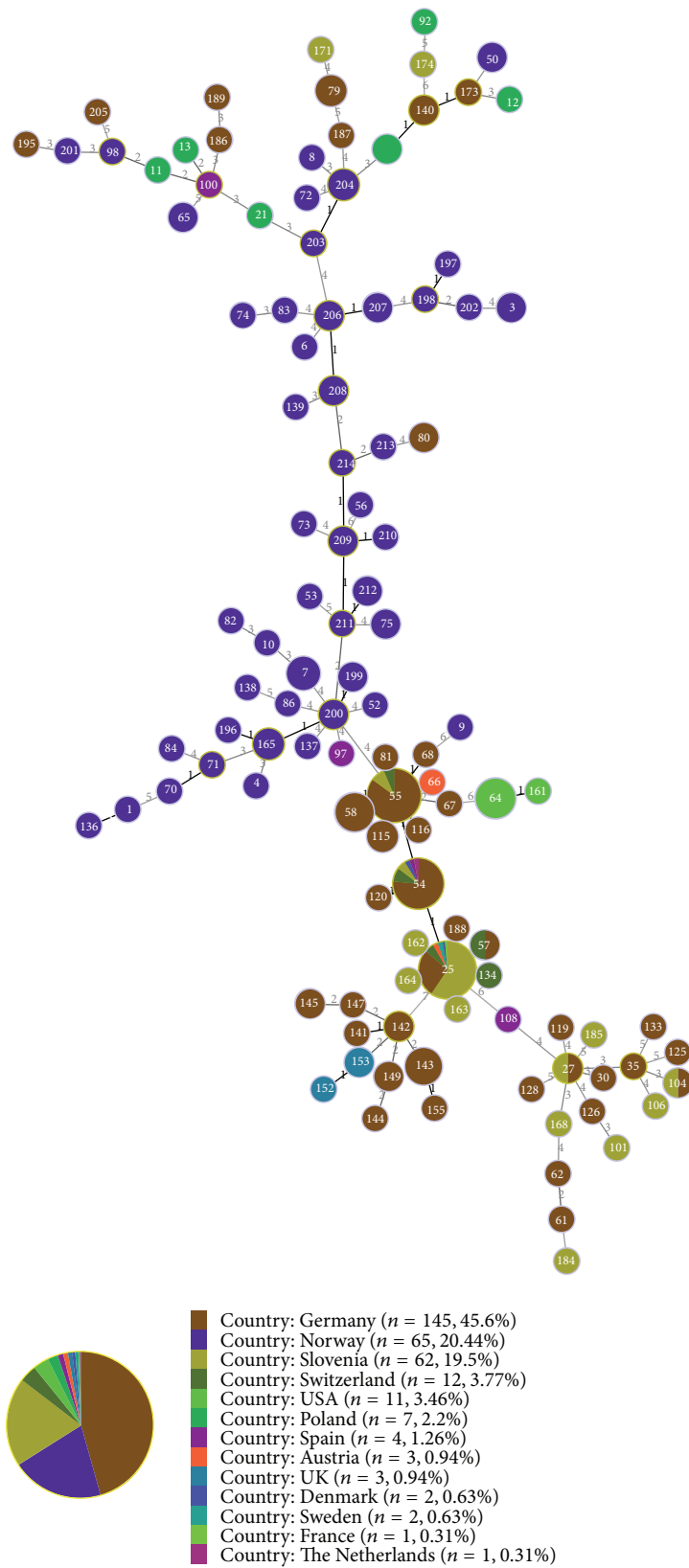
FIGURE 2: goeBURST full minimum spanning tree of STs from the A. phagocytophilum MLST database.