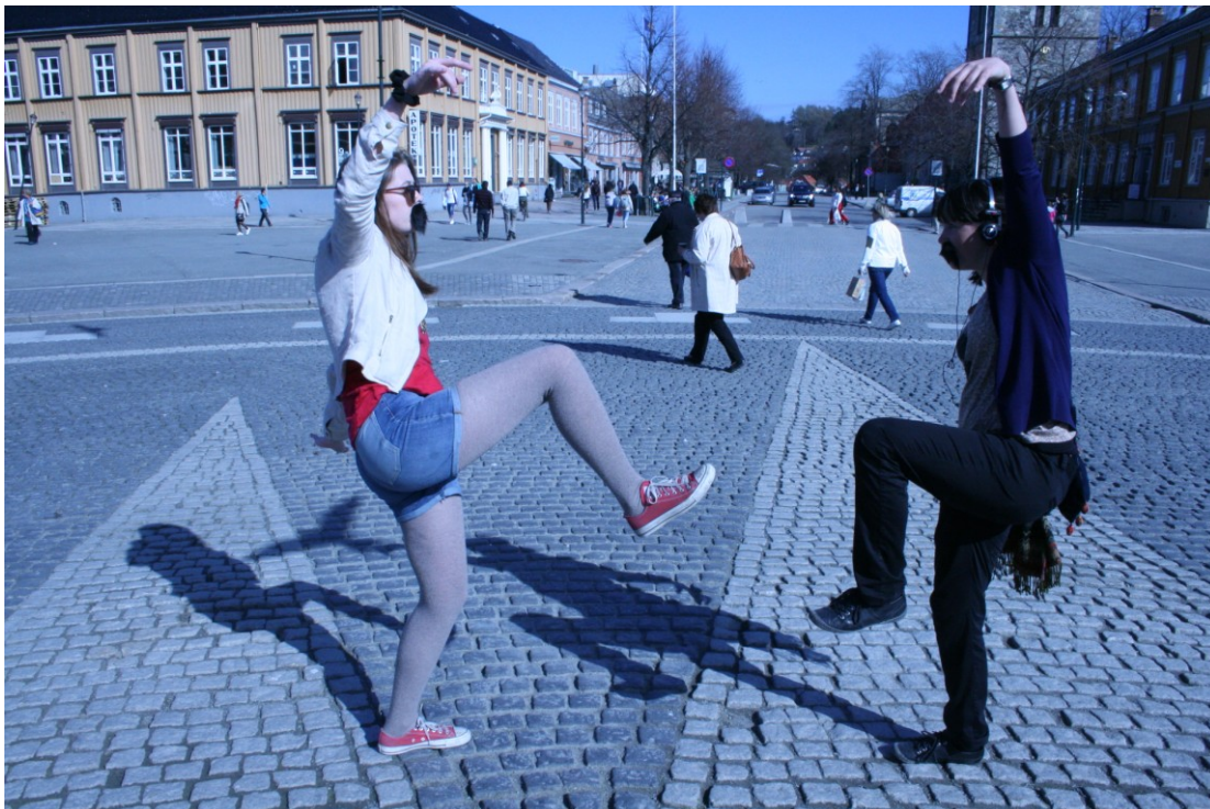
Figure 5. Chain Reaction , 2011. A group of players complete the mirror task at Trondheim’s main square during the play-test.

If we look at the tasks that made it into the final performance, it is possible to illustrate the compromises that were required. For example, if we consider something we called the ‘mirror task,’ we see an example of a task that satisfactorily addressed both the artistic and the academic questions. In this task, we decided to have the players use smartphones and a headset, so that they would listen simultaneously to a music track and mirror each other’s movements. Two players were situated on opposite sides of a public square, fifty meters from each other. They were asked to gradually move towards each other, mirroring each other in slow motion until they physically touched each other, as shown in Figure 5. During the play-tests and the public performances, we found that when listening to a common track, the participants were better able to connect with each other and block outside noise while simultaneously performing the movements in a public space.