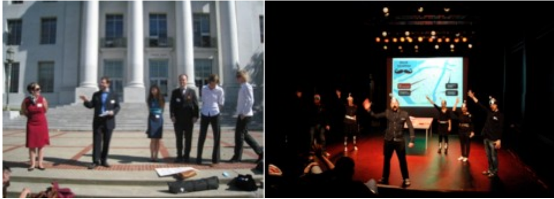
Figure 2. Theatrical introductions to Chain Reaction in Berkeley (2009) and in Trondheim (2011).

In the Trondheim orchestrations (twice on 27-28 May 2011), the story setting had a humorous, science-fiction narrative set in present time, where the players—characterized as aliens disguised as humans—were preparing for an invasion. In this expedition, the players were sent out into the city to gather data that would help aliens successfully invade Earth, finding out what was essentially human so that it could be co-opted for alien purposes. Their findings would also be presented to the other participants in the form of a performance, where they would have to use the materials they had collected through the city.