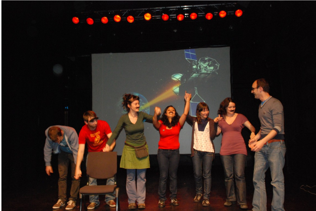
Figure 4. The winners of Chain Reaction in Trondheim right after their performance.

At the last checkpoint, the players had to create a short performance piece out of the materials they collected. Each group performed its piece for the rest of the participants—other players and the actors—and there a final and informal vote was taken to decide on the ‘best’ show, whereby the ‘winners’ earned a symbolic trophy and the others received a badge as a keepsake of the event. After the event was over, the players were encouraged to document their experiences through text, pictures and videos posted on social media sites such as Facebook and/or SFZero. 2