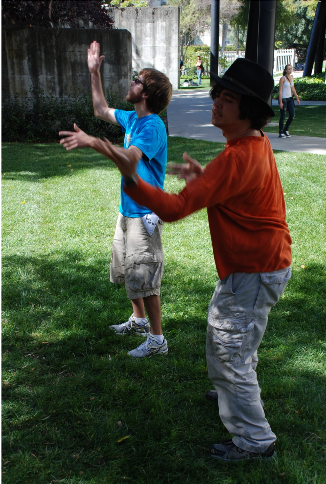
Figure 3. Two players perform a movement sequence inspired in the environment during a play-test in Chain Reaction , Berkeley.