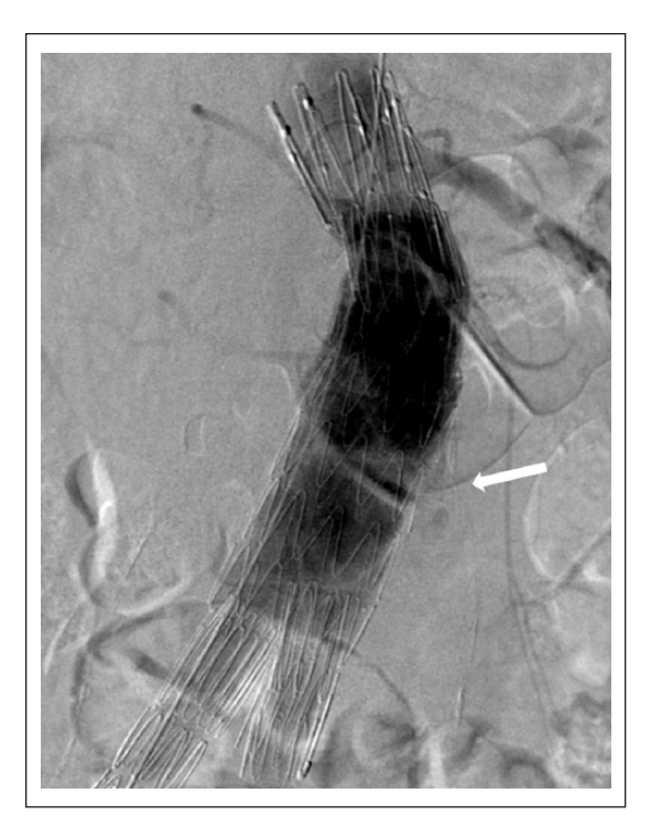
Figure 2. Minimal type I endoleak.

follow-up had an increase in aneurysm diameter on the last follow-up, but none of these patients had clinical indications of aneurysm-related mortality.