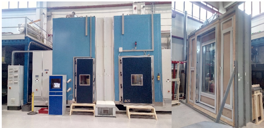
Figure 1a and 1b. Climate simulator and double skin facade

The test cell that functions as the outdoor environment is equipped with a solar simulator, a matrix of 9 metal-halide lamps (0.4 m x 0.4 m each) for a total size of 2.4 m x 2.4 m. This system can deliver an irradiance of 1000 \text{ Wm}^{-2} at 0.8 m distance from the lamps plane, with a spectrum that replicates (as much as possible) solar at the Earth surface. The solar simulator can be dimmed in the range 40 % to 100 % and draws up to approximately 44 KVA. Air temperature, relative humidity, and irradiation level setpoints can be variable during the test, so that dynamic profiles of air temperature, relative humidity, and irradiation can be realized.