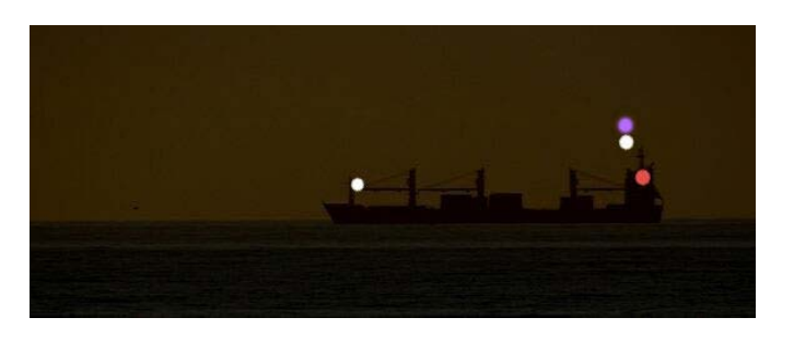
Figure 2: Should ships navigating in autonomous mode carry a special identification light? The behavior of the navigation AI

The assumption above is that if autonomous ships always follow COLREGS their behavior will be a hundred per cent predictable. But as we have seen above, this might not be true if e.g. the spectrometers onboard the autonomous ship does not interpret "restricted visibility" the same way we do (and therefore Rule 19 should or should not be used).