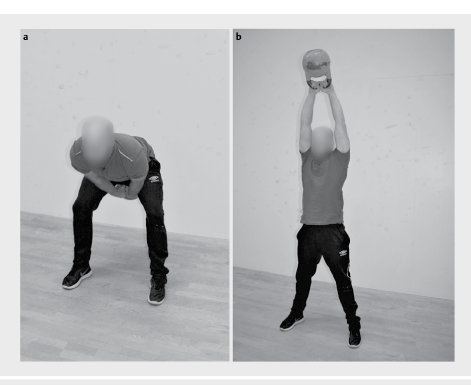
▶ Fig. 1 Two-armed American kettlebell swing, lower a and upper b position.

A two-way analysis of variance (ANOVA) with repeated measures was used to assess differences in EMG activity for the different muscles. The two factors were exercise (one-armed- and two-armed American swing) and side (contra- and ipsilateral). When interaction or main effects were detected by ANOVA, paired t-tests with Bonferroni post hoc corrections were used to determine where the differences lay. The analyses were performed for both the whole