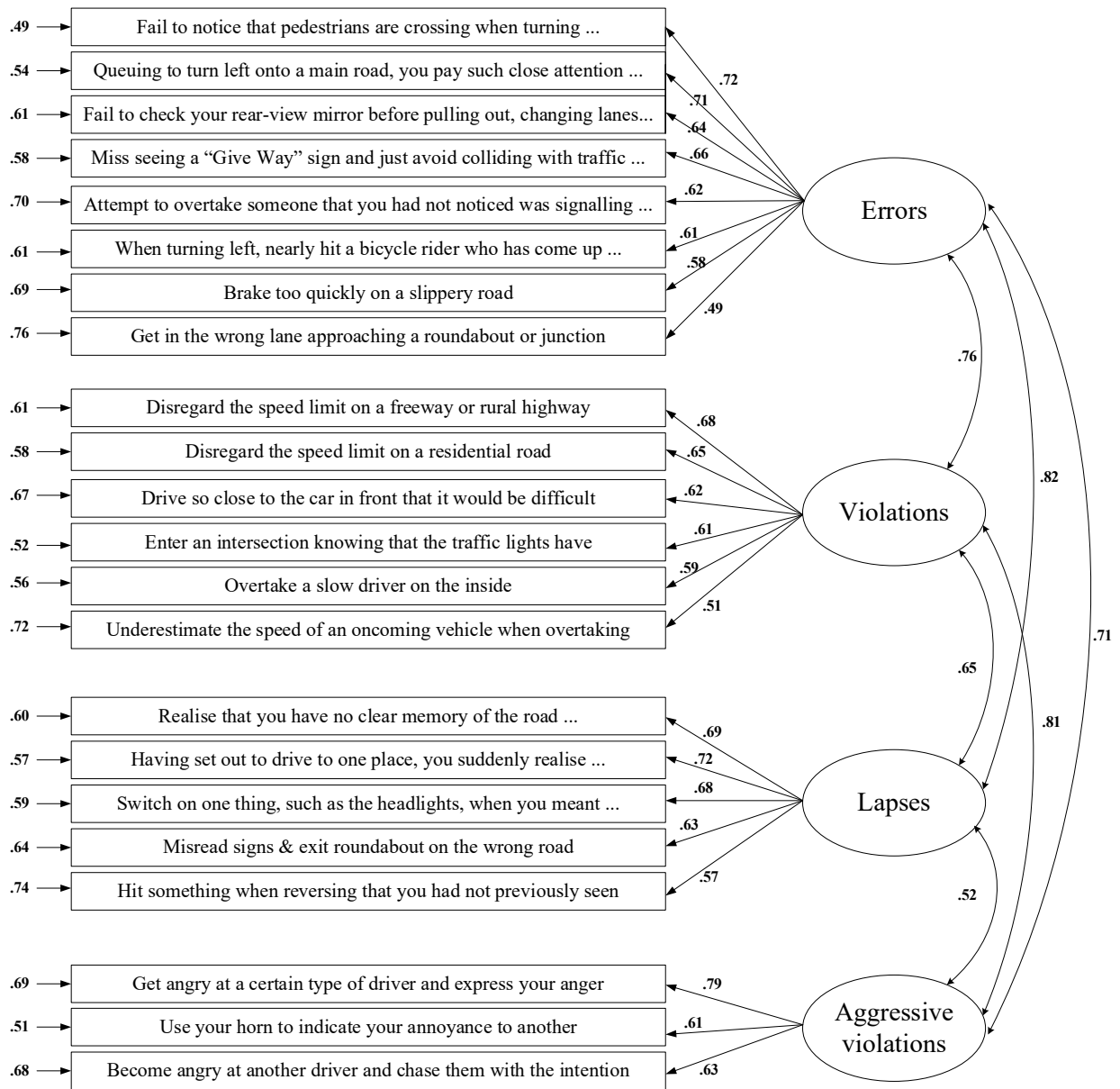
Fig 2. Four-factor solution of the DBQ