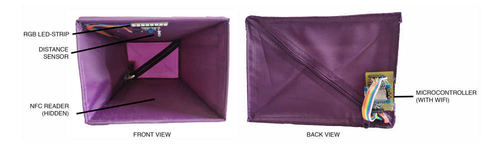
Fig. 2. Front and back view of the augmented shoe box.

without registering additional information or keeping an order. The NFC reader is hidden on the bottom part of the box, so there is no risk of breaking it when putting the shoes inside.