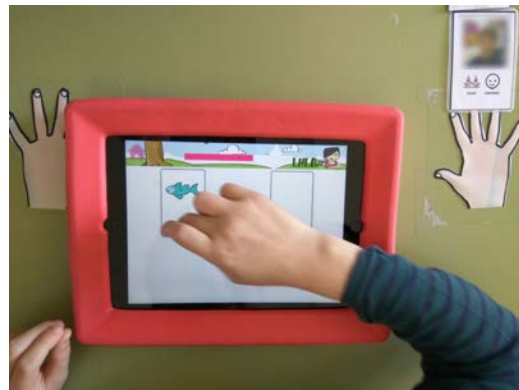
Figure 3: one of the participants using "Leo con Lula" in a class setting. The hands on the sides limit the space to put the tablet, so they have to focus on the task and adopt a proper position.

At the end of the week the teachers were asked a short questionnaire to gather their feelings and experiences about the pilot.