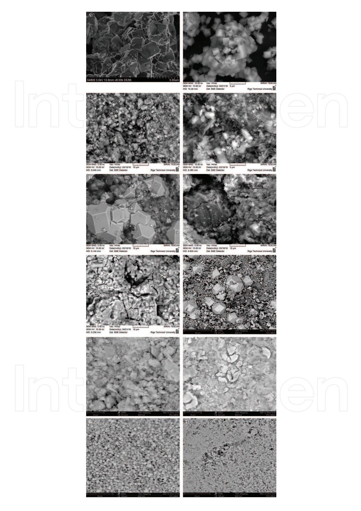
\textbf{Figure 2.} \ \ \text{SEM micrographs of studied materials: (A) 4A; (B) Mn-4A; (C) Ukr; (D) Slov; (E) Mn-Slov(1); (F) Mn-Slov(2); (G) FeMn-Slov; (H) CaMn-Slov; (I) Khol; (J) Fe-Khol; (K) 13X; (L) Fe-13X.