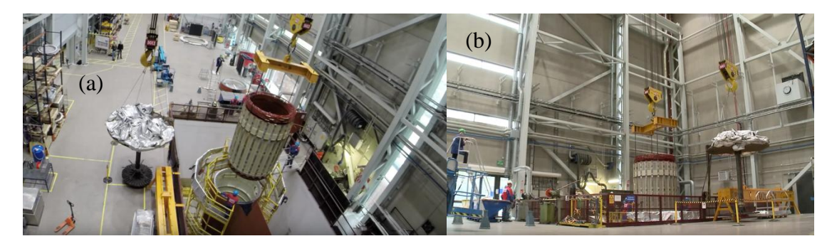
Figure 1. The original shrinking fit lift operation to be automated in the project. Screen captures are taken from a video of the assembly [2]. The capture (a) is the view of the operation from above at the time 0:24 and the capture (b) is a side view at the time 0:26 of the video.

The idea behind this study was to create a proof of concept solution to simplify and solve this lifting problem. During the course of this project, we realized that we had developed insights that could possibly be utilized in other similar projects, so we began generating hypotheses for the very early stage: the 'fuzzy front end' of product development of applications for heavy industry connected devices [3]. The linkage between the flexible design process and firm competitiveness in the early phase was discussed extensively in the software engineering process community whilst adopting agile methodologies [4], as shown in [5,6]. Industrial Internet, as a complex field of mixing digital and physical development, would benefit from similar discussion [6]. By doing the case by ourselves, the detail of research data became very rich. We created the hypotheses based on building the prototypes, showing the thinking behind the whole development process and finally our reflections on it. The case is in hypothesis format so that other researchers and practitioners can then further explore, test, and build upon it.