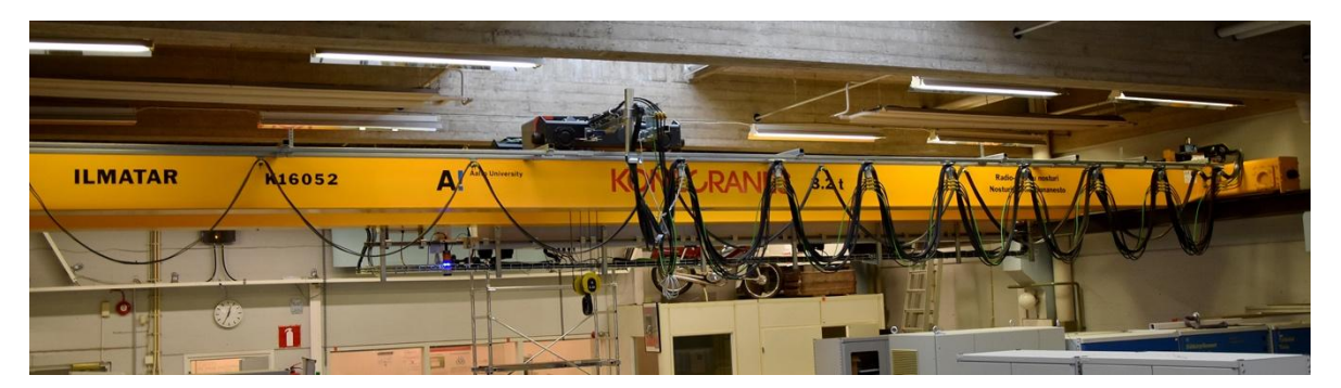
Figure 2. The Industrial Internet overhead crane used in the research.

The resources for this project were a total of seven weeks of design, development and building time from a two-person group and material costs of around 200 euros (additionally the cost of an external experimental setup, that will serve many projects). The project resulted in a development platform for high accuracy positioning with an overhead crane and the first proof-of-concept solution