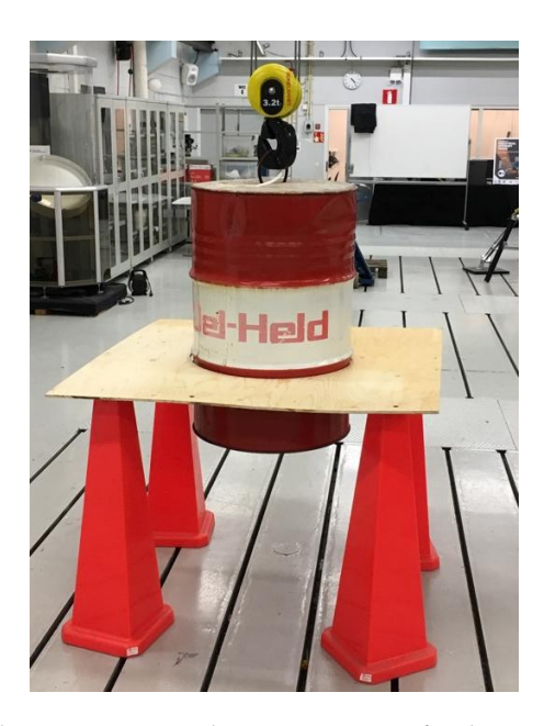
Figure 5. Early prototyping and concept creation for the test rig. Probe 34.

The image detection prototype combined five probes (28, 10, 29, 33, 12) seamlessly together as the working prototype required laptop, OpenCV, camera, can, and Python simultaneously. Also, the camera (Probe 29) and oil barrel test rig (Probe 34) were tested together.