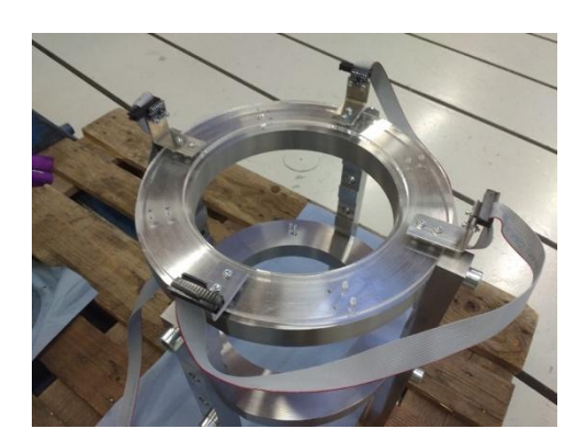
Figure 6. The top view of the Probe 37, which was also the final physical form of the prototype.

The main task required parallel work of many probes to create the proof-of-concept prototype. Therefore Probes 16, 17, 12, 19, 20, 36, 37, 30, and 31 were implemented together although full integration was not reached. Furthermore, the week had two minor actions with the combinations of Probes 30 and 32 to test ToF sensors with Arduino and Probes 36 and 37 to assemble the full mechanical test rig.