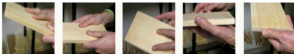
Photo collage 6. A teacher languaging his thinking with a wooden piece of pine as actant and affordance for his thinking.