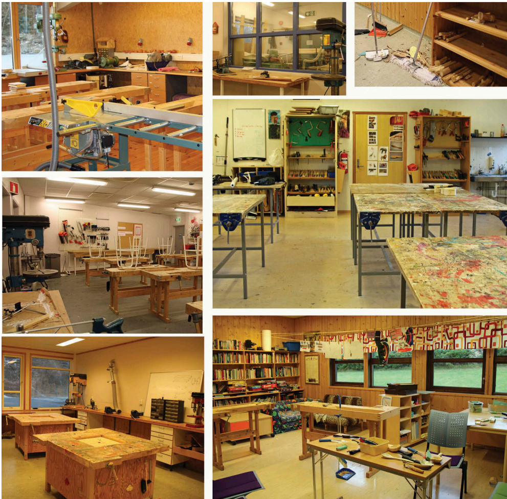
Photo collage 3. Woodworking rooms where the multisensory interviews took place.

To be surrounded by, or be part of, the woodworking rooms served as the very foundation for the interviews. In this lies my intention of trying to “awaken” the teachers’ embodied memory through embedding the interviews into the woodworking spaces. In the woodworking space the teachers’ embodied memory, as well as my own, is put into play by the space itself, as the space itself has agency; it is an actant (Latour, 1996) that actually does something with the teachers and with me in a very real way.