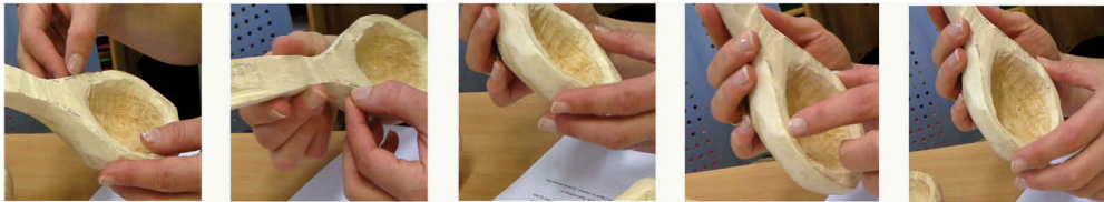
Photo collage 5. Teacher holding and showing an artefact made by a child, while thinking about and explaining the teaching.

In one of the schools I visited, the pupils were in the process of making ladles out of a willow tree that had been cut down in a forest behind the school. The teacher and I sat down for a long time while having these carved artefacts at hand.