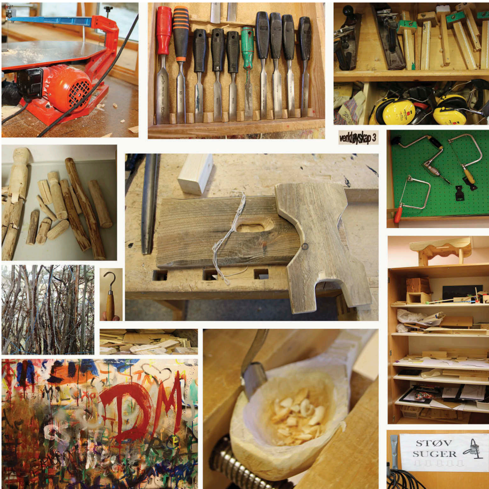
Photo collage 2. Woodworking rooms with agency – examples of the variety of photographic empirical material.

In six of the eight schools I had the possibility to observe children (from age 6 to 12) working in class, and in all the schools I performed multisensory interviews with the teachers. The school visits varied in length, from two hours to a whole working day for the teacher. These school visits can best be described as sensory explosions. The sound of hammers, saws and drills in action at times was so deafening that ordinary speech was out of the question. The fine layer of wood dust sometimes hindered the writing of my observation notes. Despite the short time span of the school visits, the sensory traces they have left on/in me have been rich and important when it comes to giving me an experience of the different characteristics and qualities at work in the different schools. As a result, the empirical material produced consists of a variety of expressions; 1074 photos, 8 research journals, 181 minutes of video material, 6 observation logs, 640 minutes of audio material and 182 survey responses (the survey is mentioned here only for contextualization; see Maapalo, 2017 for analysis of the survey).