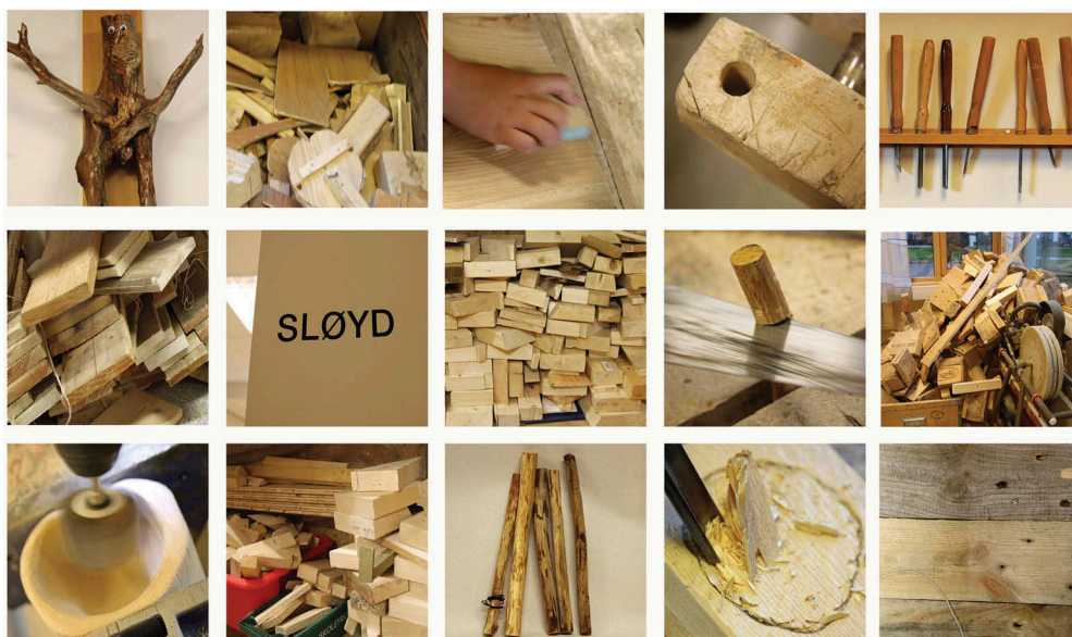
Photo collage 1. Agency of Wood – Materials, rooms and tools with affordances inviting to action.

Johnstone, 2009). It is through the embodied, sensory meetings with materials that I seek to understand the teachers' practice theories (see Kemmis et al., 2014) and produce rich interviews and discussions. Based on a broad understanding of how learning is embodied and material, embodied engagement activating the senses in this study is seen as primary, not secondary, in the teachers' and researcher's meaning-making processes.