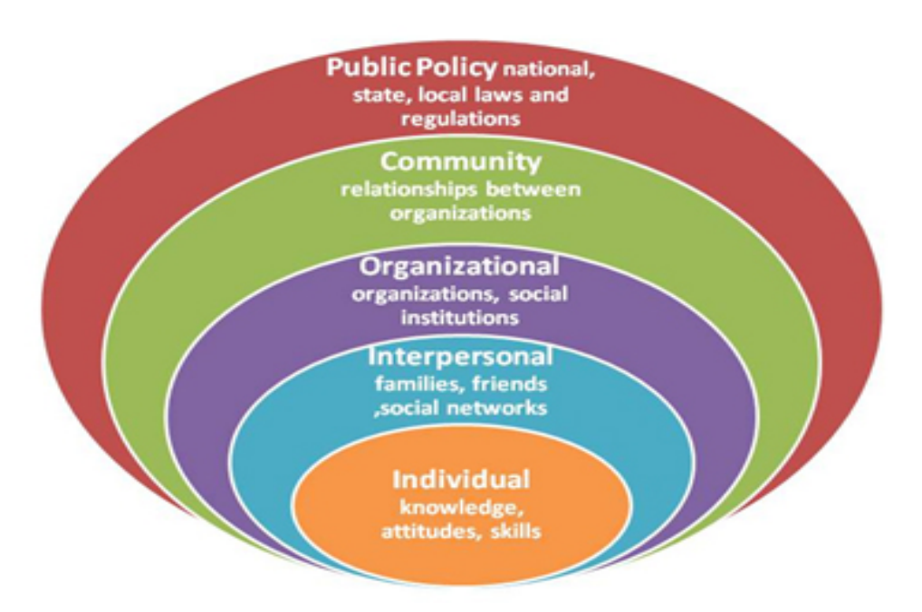
Figure 1. Ecological Model of Health Determinants

There are numerous factors that affect adolescents' health, which in turn has an impact on their lives at different levels. Ecological contexts extend the consideration from focusing on personal levels, to awareness and sensitisation against contextual characteristics and systemic consideration such as the families, schools and communities (Bronfenbrenner & Morris, 2006). Ecological models may contribute to understand the many determinants that may affect mental health outcomes during adolescence. These models position adolescents in the context of their families and peers, teachers and service providers, social values and national policies. All these different actors, relationships and exposures, which interact and influence the choices that adolescents make, their aspirations and their actions, ultimately affecting their health and development (WHO, 2014 a).