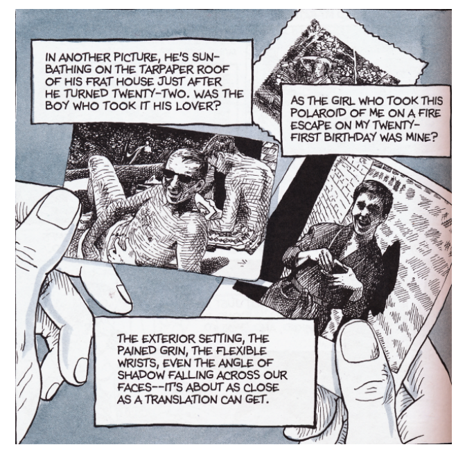
Figure G, Fun Home page 120.

pictures and Bechdel says that "the exterior setting, the pained grin, the flexible wrists, even the angle of shadow falling across our faces—it's about as close as a translation can get" (120).