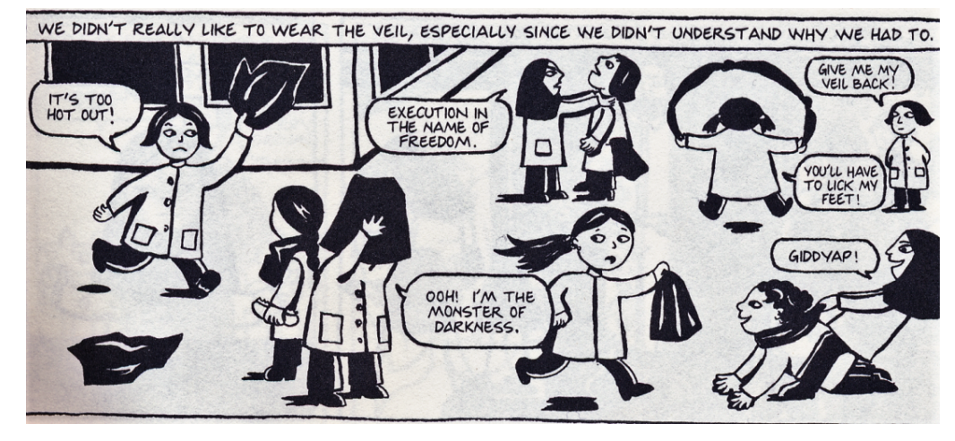
Figure C, Persepolis page 3.

The defamiliarized and ironic presentation of the veil brings out the message that Iranian children are not that different from children elsewhere in the world. By adding humor, Satrapi builds bridges between different cultures and readers of different backgrounds, who can relate to the story of a girl growing up. For the unfamiliar audience, such portrayals are important for creating understanding. By balancing the familiar and alien, her non-Iranian readers start to understand the experiences and diverse attitudes of the people in Iran. The laughter and irony also function as an emotional relief, where the reader can relax and enjoy the scenes that stand in contrast to dark situations and make the reader able to grasp Marjane's traumatic experiences of public life. Furthermore, humor can arguably make narratives of trauma more realistic because it makes the memoir resemble life to a greater degree, as life is tragicomic and placed in the borderlands of tears and laughter.