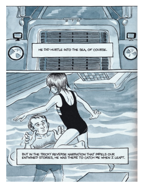
Figure H, Fun Home page 232.

In Fun Home , we are exposed to Bechdel's necessity to trace her father's secret and recover the truth in order to move on. The function of stories of trauma, dealing with the past (and storytelling in general) is according to Watson, "a process of retelling life experience of trauma and disappointment until the teller discovers some form of resolution that can both acknowledge pain and provide the closure of a happier ending" (149). The last frame of the memoir, which depicts young Alison and Bruce in a swimming pool, suggests a closure for a happier ending.