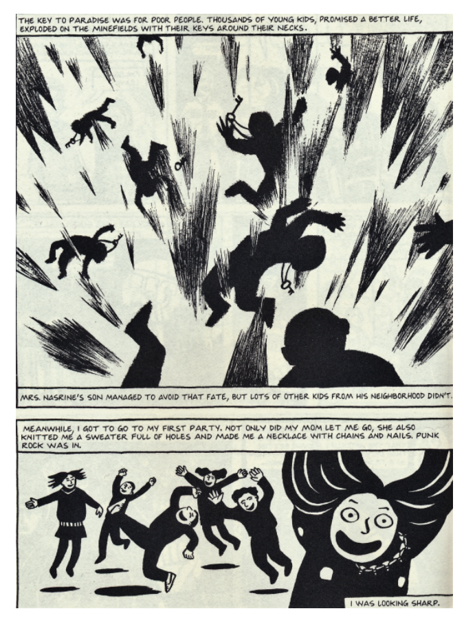
Figure A, Persepolis page 102.

The upper frame stands out by its dramatic style and demonstrates Satrapi's diverse artistic expression. Here, the martyr-boys are portrayed as black contours without identities to emphasize their quantity, and the black lines pointing down function to illustrate the boys' fall. The key is highlighted to stress its surreal significance to the boys, who were brainwashed to believe that it was a key to paradise. Although the reader, as well as Marji, has trouble with understanding the act of sending away poor boys to die as martyrs, she can relate to and identify with the memory and excitement of dressing up in new clothes and dancing at a party for the first time. As a result, Satrapi balances the memoir by toning down the trauma of the Islamic regime and war through representations of such experiences.