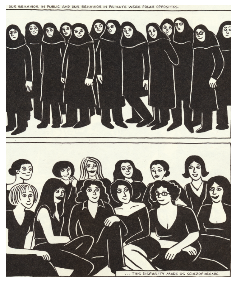
Figure D, Persepolis 2 page 151.

The frames are presented as two photographs of the women, one with and one without the veil, and reveal the diversity of the female characters by presenting them both as modest and sexy. In the upper frame, some of the women are portrayed with a smile or maybe a flirtatious look, but they are generally depicted with more female traits, not only in their bodies but also in their faces and postures, when Satrapi uncovers them. The page demonstrates how the women had to juggle between and distinguish private and public behavior, or how they became "schizophrenic" as Satrapi herself says.