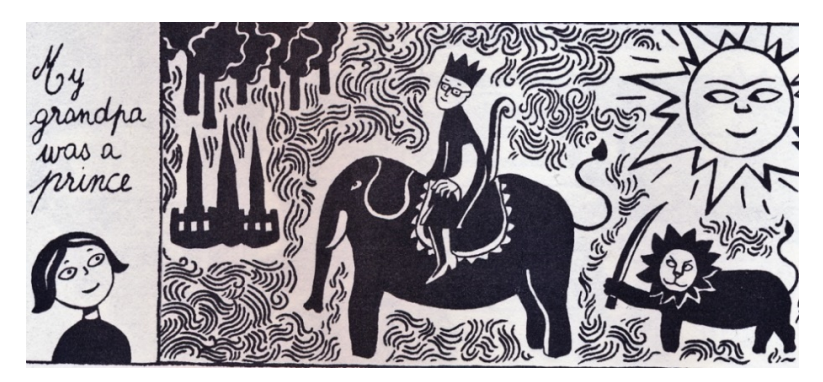
Figure B, Persepolis page 22.

Satrapi portrays a limited understanding that is naive and where, as Gilmore argues, "the adult autobiographer knows more now than the child self she represents" (162). As readers of memoirs, we understand that the child's narration is told by an adult version of the protagonist, whose knowledge is greater. Marji's limitedness is also seen in Satrapi's style, which emphasizes the witness' degree of maturity. Satrapi herself says that "the first book is about my childhood, so I draw like a child" (Root 154). By drawing immaturely, Satrapi can reflect the child's imagination and ways of thinking or experiencing. This limitedness and imagination is exemplified in the portrayal of Marji's understanding of her family history, where she imagines her grandfather as a price.