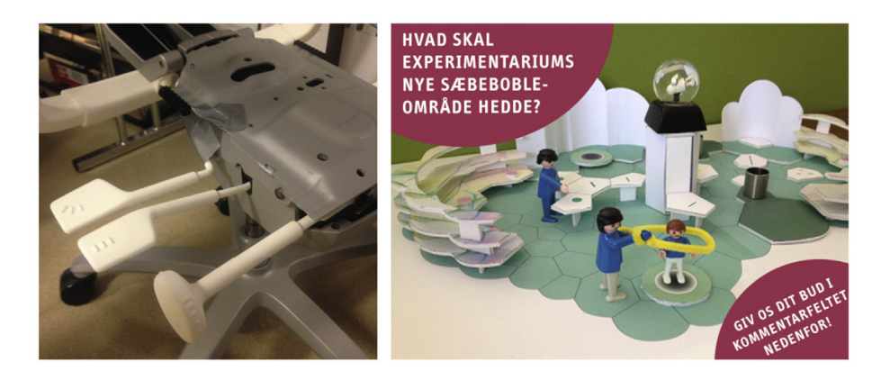
Figure 4 Example of a low-functional prototype used in the stages after concept development. From the left 3D printed handles used by Scandinavian Business Seating (prototype no. 6) and a small scale model of the future soap bubble exhibition at Experimentarium (prototype no. 13)

The prototypes were further mapped by type of stakeholder involvement and connection to elicited requirements. They were clustered in groups