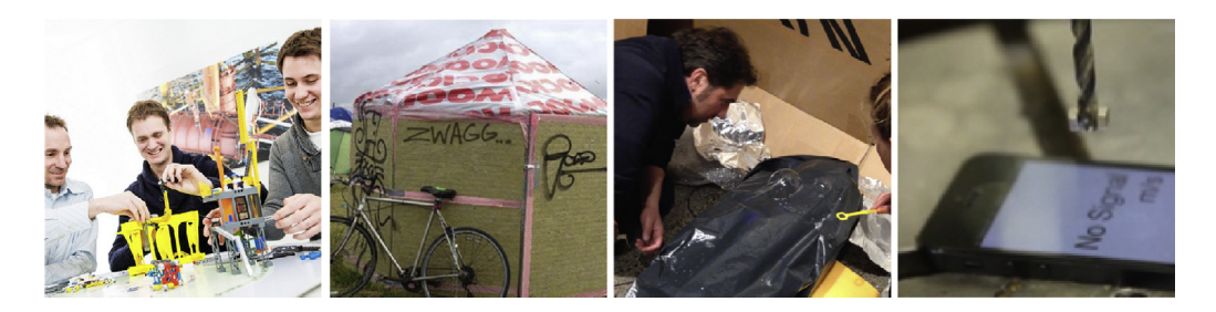
Figure 3 Examples of high-functional prototypes in the concept stage. From the left Lego Technique prototypes used by PREZIOSO Linjebygg (prototype no. 2), huts for Roskilde Festival used by ROCKWOOL (prototype no. 10), testing soap bubble exhibition idea used at Experimentarium (prototype no. 12) and Vaavud exploring magnetism and the magnometer in an iPhone (prototype no. 14)

This method is cited as being supportive of managing complexity in a project (Dow et al., 2010; Snowden & Boone, 2007). By being highly functional and