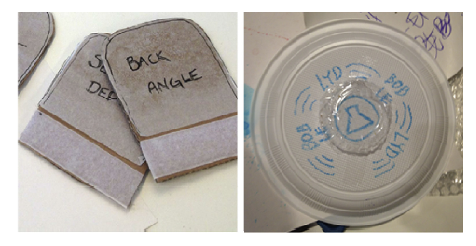
Figure 2 Example of low-functional prototypes used in the concept stage. From the left prototype handles of cardboard used by Scandinavian Business Seating (no. 4) followed by prototype no. 11, communicating the idea of a soap bubble being affected by the vibration of sound.