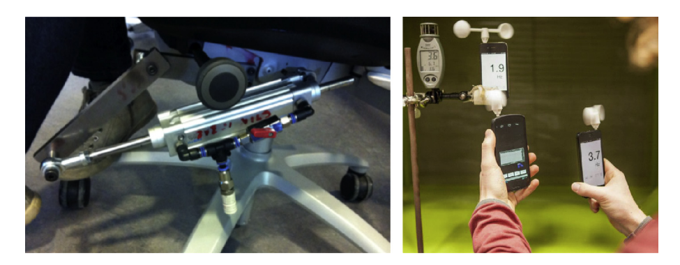
Figure 5 Example of high-functional prototypes used in the stages after concept development. From the right, hydraulics test used by Scandinavian Business Seating (prototype no. 5) and Vaavud testing fluid mechanical properties in a wind simulator (prototype no. 15)

depending on whether they were used in one of the three contexts defined in the theoretical section: