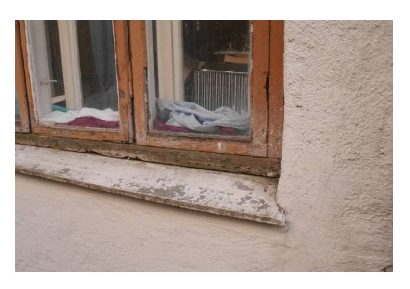
Plate 2. Residents use fabrics to avoid drafts from the old windows

Figure 1. Plan layout of apartments in the front building