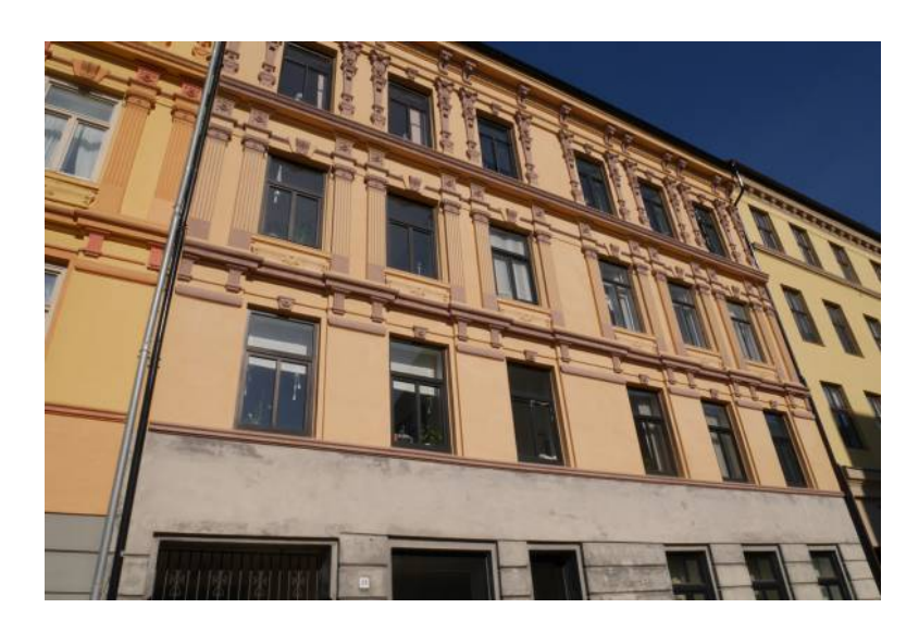
Plate 1. Facade of the case study building block

At a national level, the Directorate for Cultural Heritage is responsible for the management of all protected archeological and architectural buildings, monuments, sites and cultural environments in accordance with relevant legislation. Each county employs officers