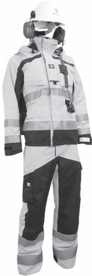
Fig. 1. The new outer layer jacket and pants developed in the innovation project.

the stages of 1) Establish insights of user needs and context of use , 2) Specify design objectives , 3) Design new solutions , and 4) Evaluation 28 ). Petroleum workers were involved throughout the design process; in establishing user insights, in concept development by participatory design, and in evaluating the design via field testing.