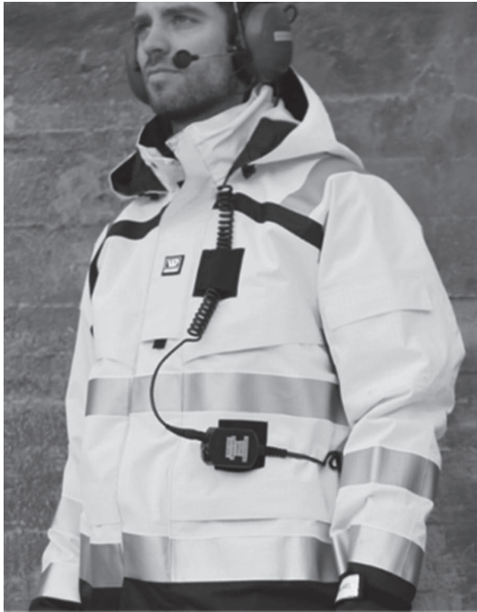
Fig. 2. The new jacket solution for cable management.

the work coveralls. Radio cables run freely from the radio unit to a push-to-talk unit (PTT), and then up to the hearing protectors mounted on the helmet. The PTT is attached with a clip to the front of the PPC anywhere the users can make it stick. The radio cables represent a risk of snagging and a source of irritation, and this issue was pointed out by several users following the first field test. When working in heights, a detachment of the radio cable involves a safety risk by loss of communication with the support crew on deck. Thus, a specific solution for cable management was developed (Fig. 2). Users pointed out practical positions for attachment of the PTT, based on considerations of easy-access and limited risk of snagging, and tailored patches dedicated for sturdy attachment of the PTT was incorporated in the design. The PTT can be attached at two alternative positions, and the patches are compatible with PTTs from different suppliers, which have the attachment clips oriented opposite ways. They also function as tunnels for the radio cable to keep it in place close to the body.