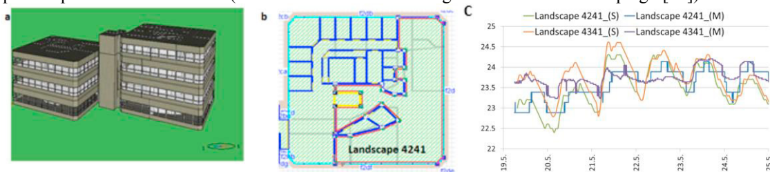
Fig 2 (a) drawing of the simulated building 4 and 5. (b) Landscape.4241 at the second floor in Building 4 from IDA ICE. (c) Results, (S) = simulated, (M) = Measured.

The simulation has been tuned for the monitored week. Occupancy, outdoor weather, and additional information mirrored measured values. The results obtained are shown in Fig 2c. The difference between measurements and simulation is always below 0.5 \text{ }^\circ\text{C} so we can assume the simulation validated. It seems that the simulation under predicts the effect of the thermal mass as temperature variations in simulation are bigger than in measurements. However, no correction of real solar gains and solar shading is done in simulation, as no measurements were available. Despite the large airflow rates and low occupancy, the temperatures are measured to be around 24 degrees that the occupants report to be comfortable (cf. interviews realized during the measurement campaign [10]).