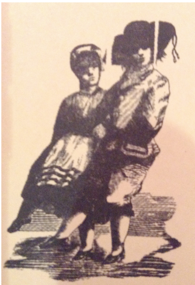
Fig. 3. An enlarged excerpt from a poster advertising performances in St. Petersburg in 1862. 42

Throughout their thirty years of performing, the Johannesénske enterprise continued to feature pantomimes. This type of comic entertainment – mimed theatre interspersed with dance – portrayed easy-going narratives. The featuring of pantomimes is interesting because it reflects both Nordic as well as itinerant performance traditions dating back several hundred years. Traditionally, pantomimes could be staged with a small number of performers; they were