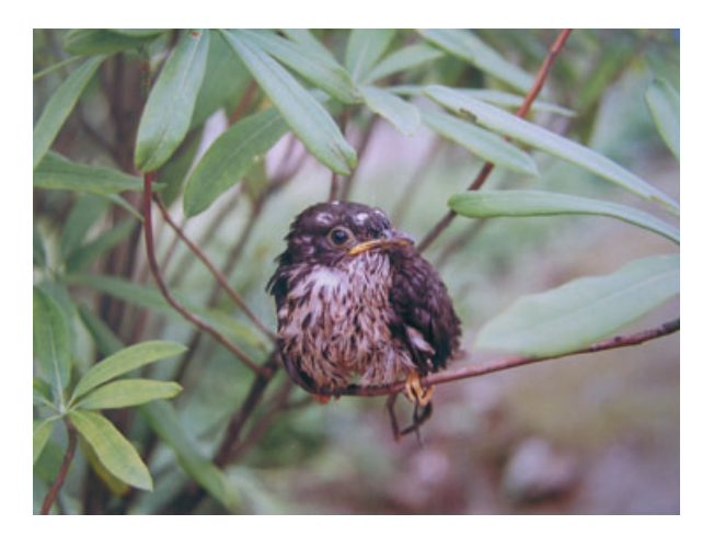
Figure 4. Nestling of a Large Hawk-Cuckoo at 18 days of age, shortly before fledging.

Hawk-Cuckoo chicks ejected host eggs 1.67 \pm 0.58 days (n = 3) after hatching, typical for other evicting cuckoo species.