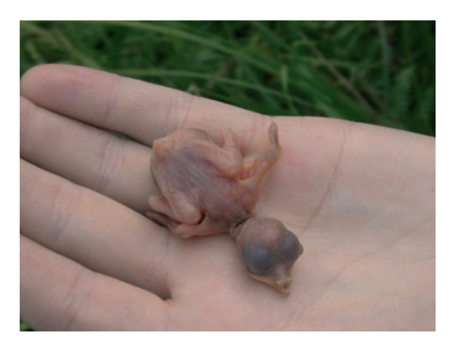
Figure 3. Nestling of a Large Hawk-Cuckoo at hatching.